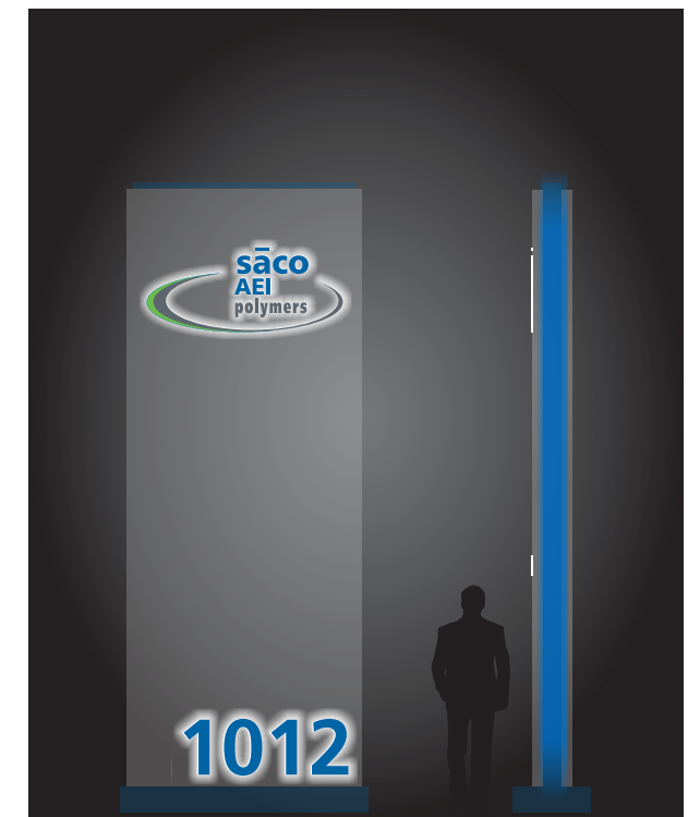
Night Time Illumination