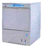
Eurodib F99EKDPS Lamber High Temp Rack Undercounter Dishwasher - (30) Racks/hr, 208-240v/1ph $4,582.00