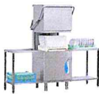
Eurodib L25EKS Lamber High Temp Door Type Dishwasher w/ 60 Racks/hr Capacity, Built-in Booster,... $9,162.38