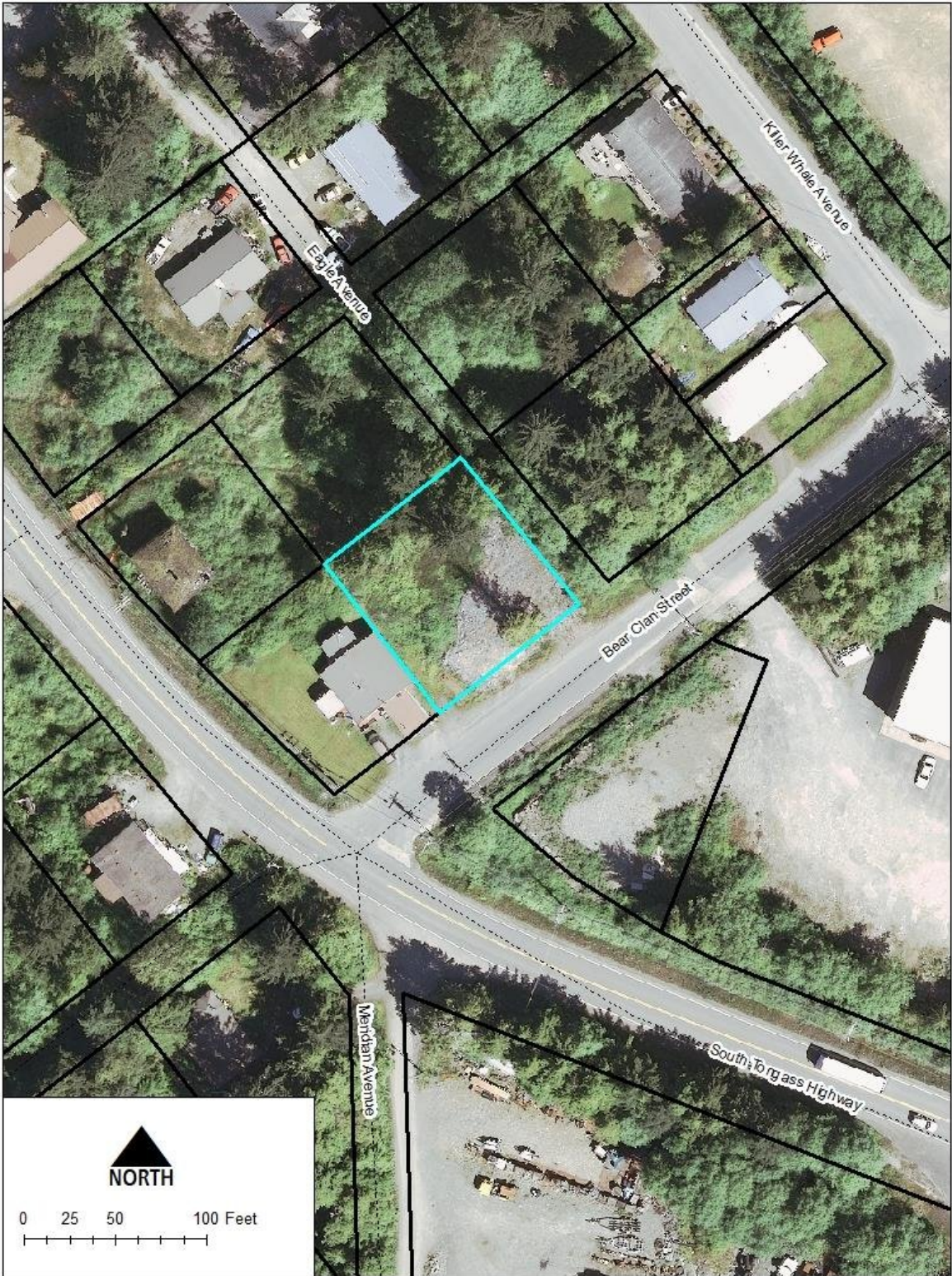
Map 1 Aerial