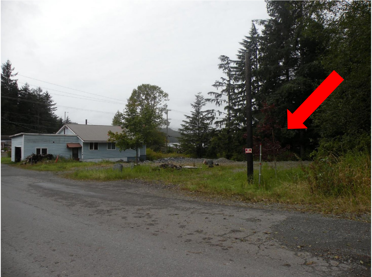
Subject undeveloped lot abuts one developed residential lot