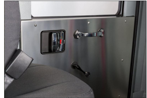
[Interior Door Handle]

The cab doors will be provided with both interior (rotary knob) and exterior (keyed) locks exceeding FMVSS standards. The keys will be Model 751. The locks will be capable of activating when the doors are open or closed. The doors will remain locked if locks are activated when the doors are opened, then closed.