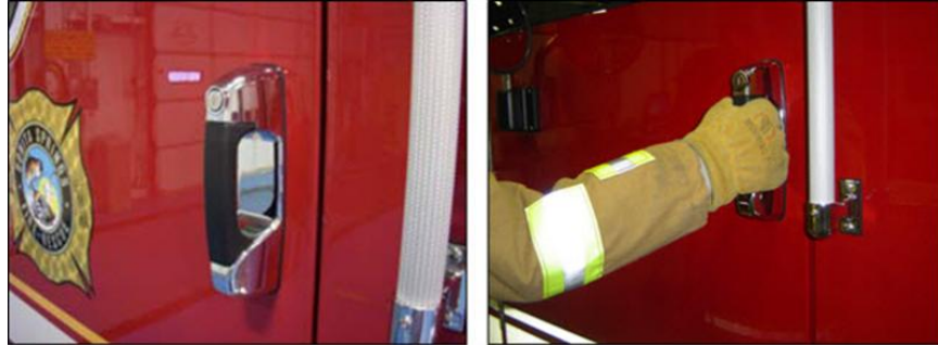
[Exterior Door Handle]

Each door will also be provided with an interior flush, open style paddle handle that will be readily operable from fore and aft positions, and be designed to prevent accidental activation. The interior handles will provide 4.00" wide x 1.25" deep hand clearance for ease of use with heavy gloved hands.