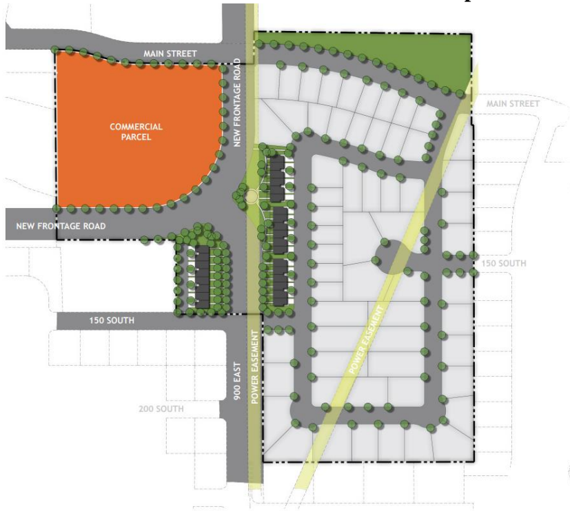
SANTAQUIN ESTATES C o n c e p t P l a n R e n d e r i n g