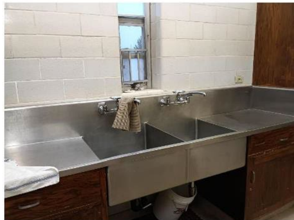
Multiple Sink Units Quantity: 3