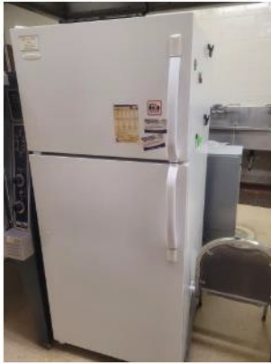
Standard upright refrigerator/freezer unit.