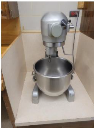
Commercial Hobart Mixer. Free-standing mixer is ideal for mixing recipes multiplied for bulk cooking. Three speed settings. Lever lowers and raises bowl to accommodate mixing and adding ingredients as well as removal of bowl for transfer of mixture to baking pans or serving dishes. Comes with two sizes of bowls, two wire whisks (large one has some missing wires), two whipping paddles, and one dough hook.