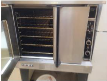
Convection Oven. Excellent for baked goods. Air circulates heat while cooking. On the side panel are the temperature and timer knobs as well as switches for off/on and heat/cooling off settings. Temperature light turn off when the oven is up to temperature. Rack slide in and out for easy removal of hot pans.