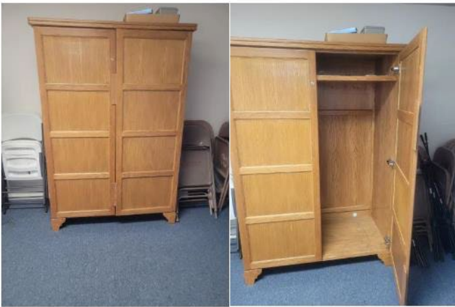
Wooden locking cabinet.