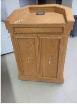
Podium on casters makes it mobile. The cabinet locks and has a shelf inside.