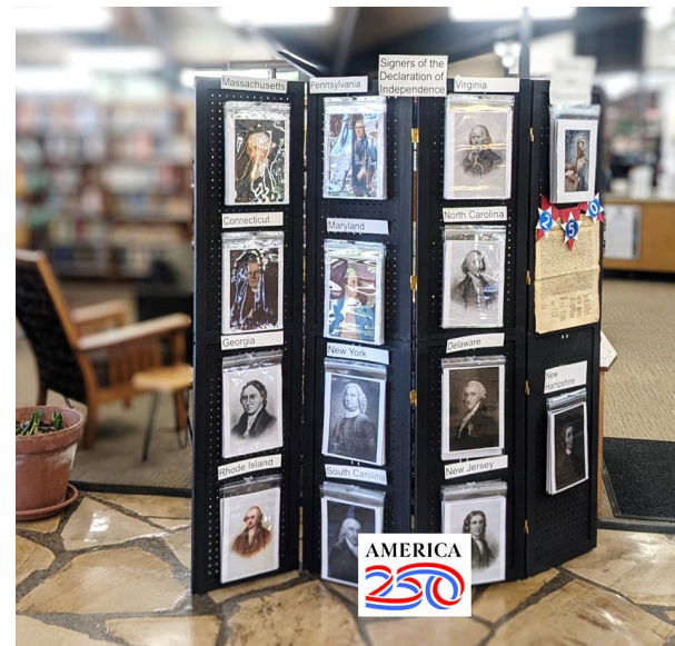
America 250 Display