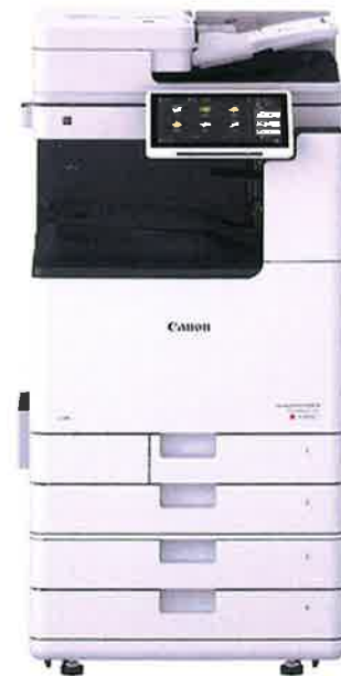
Photo may not represent final configuration