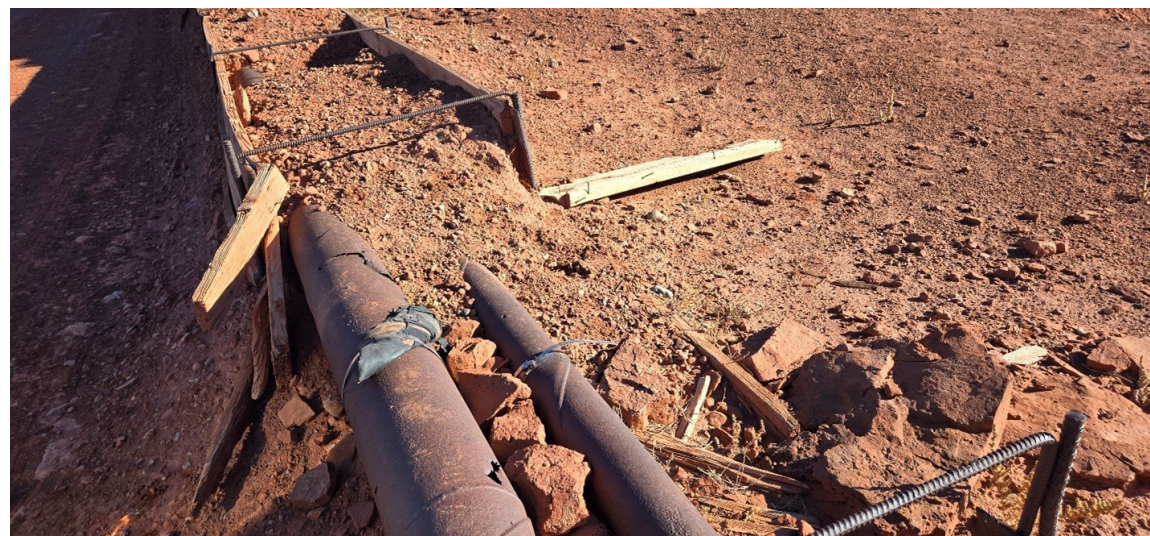
Figure 3 - Halchita Pipe Condition at Tanks

The existing pipe condition was visually determined to be in poor condition. The pipe has been laid in a box and routed to the tanks. The pipe material was observed to be ductile iron that has been severely corroded and needs immediate replacement. Pipe conditions are shown in Figure 3. Ductile iron pipe is susceptible to corrosion over time, especially in unfavorable soil conditions. The pipe shown in the image below was uncovered and exposed to elements that cause corrosion to rapidly progress. When ductile iron is used it should be buried and proper cathodic protection measures should be taken to prevent pipe corrosion and prolong the life of the pipeline. HDPE is a much less susceptible material to corrosion and would be a favorable material in this application.