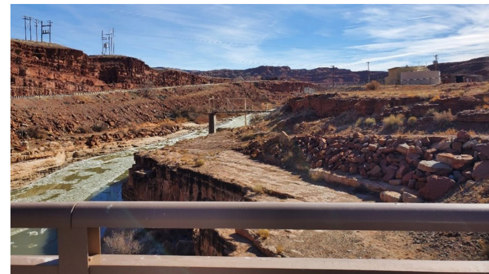
Figure 2 - San Juan River Treatment Plant Intake

The San Juan River Treatment Plant project includes rehabilitation of the treatment plant south of Mexican Hat. This project also includes the replacement and upsizing of a corroded pipeline from the treatment plant to the existing tanks. This project would provide water to Halchita as a reliable source, while also allowing for growth and other connections in the future. The existing San Juan River treatment plant has not been in operation since the early 2000s and would require significant upgrades. The treatment plant failed to properly treat the water when it was active, which led to it being taken offline. The treatment plant intake from the San Juan River is shown in Figure 2.