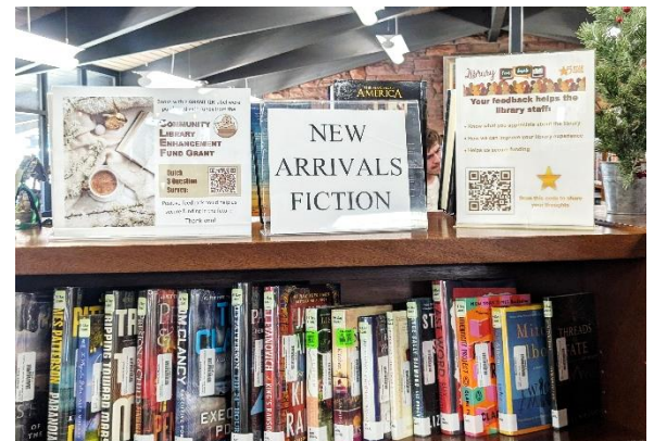
Grant Displays and survey for gathering feedback.