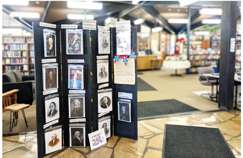
250 th Founders Display courtesy of Linda Boyle