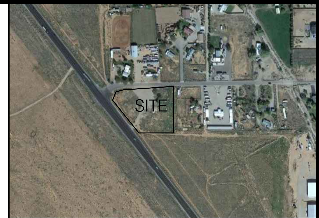
SITE SCALE: NTS

SITE BENCHMARK DESC: CUT "X" LOCATION: TOP OF CURB ELEV.: 4732.007' (NAVD88)