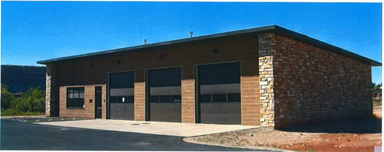
Bluff Fire Station Completed in 2006