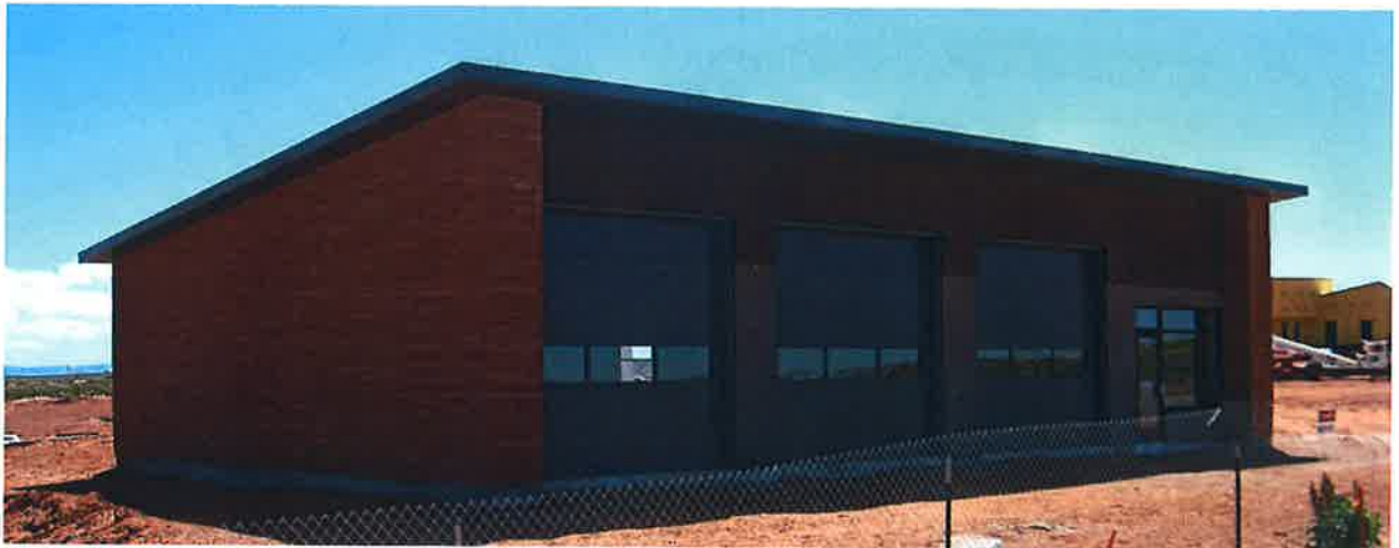
Monument Valley Fire Station Completed in 2007