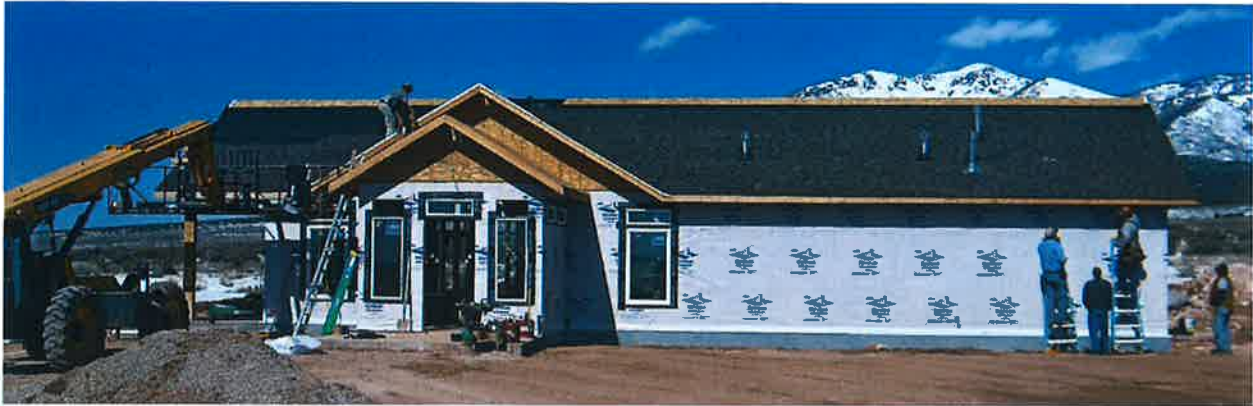
La Sal Senior Center Completed in 2008