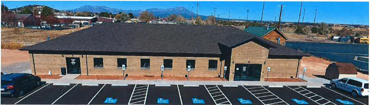
Blanding Senior Center Completed in 2019