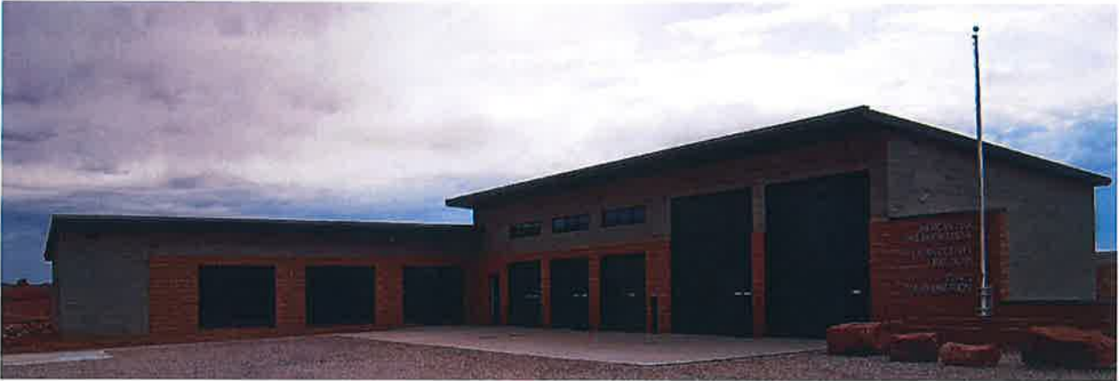
Mexican Hat Fire and Maintenance Building Completed in 2009