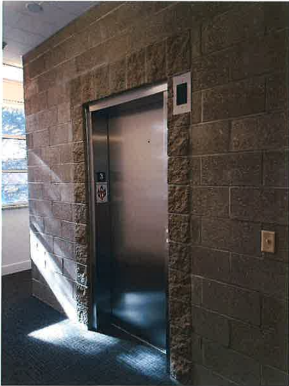
SJC Admin Building Elevator Completed in 2018