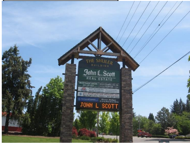
E. Sample Monument Sign (Integrated Business)