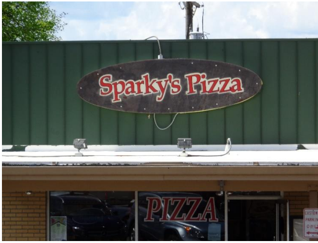
A. Sample Backlit Sign