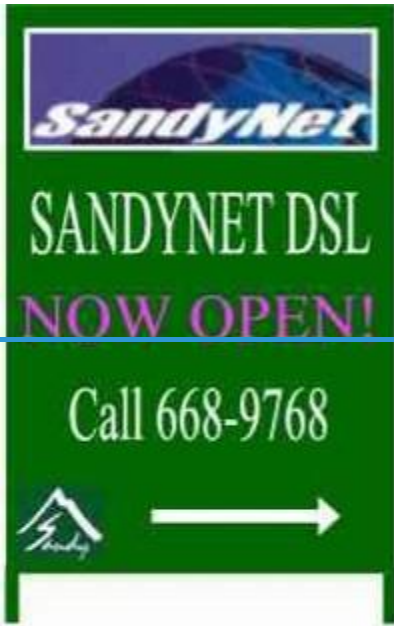
Sample A-Frame Sign