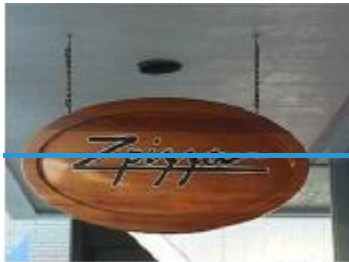
Sample Hanging Sign