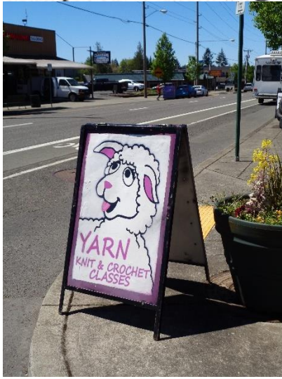
D. Sample A-Frame Sign