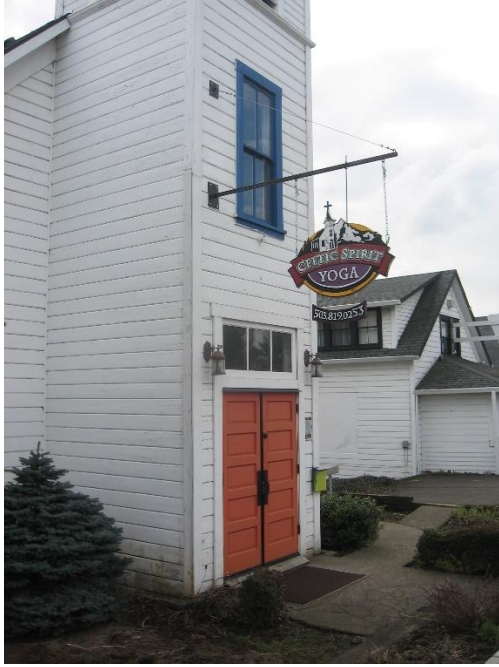
B. Sample Projecting Sign