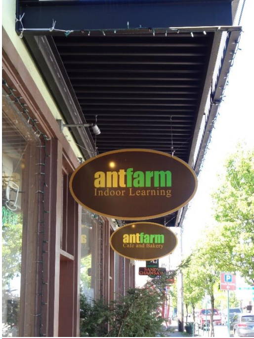
C. Sample Hanging Sign