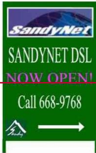
Sample A-Frame Sign