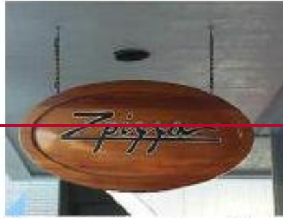
Sample Hanging Sign