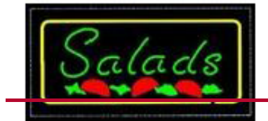
Sample Backlit Sign