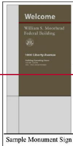
Sample Monument Sign