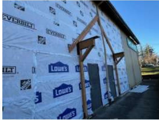
Platt Building North Elevation