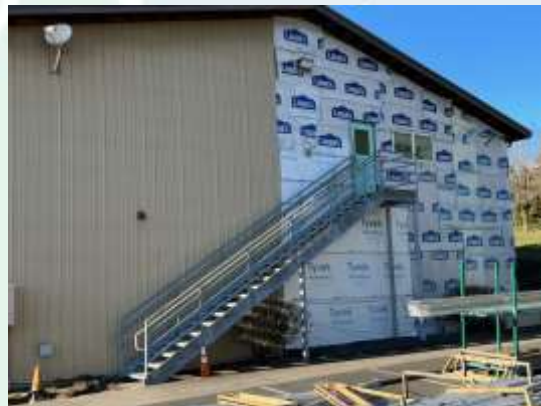
Platt Building East Elevation