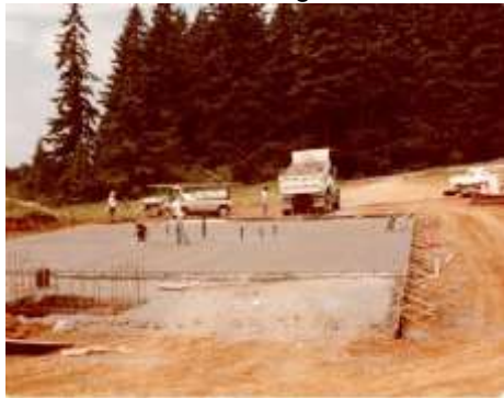
Looking West towards the Papa Murphy and Burger King site.