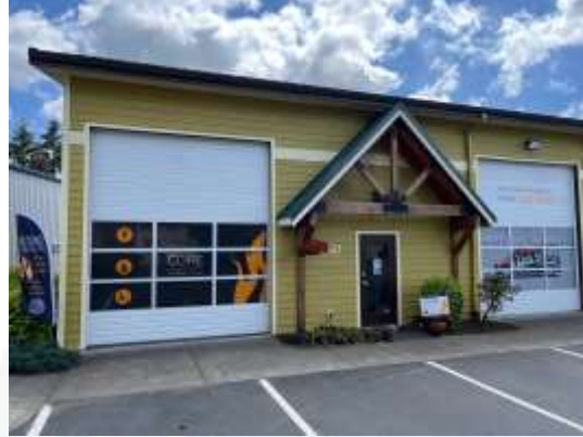
Wipper Snapper Building North Elevation