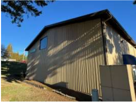
Platt Building West Elevation