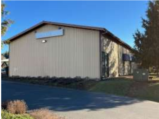
Paleo Building North and West Elevation