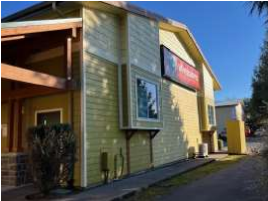
Wipper Snapper Building South Elevation