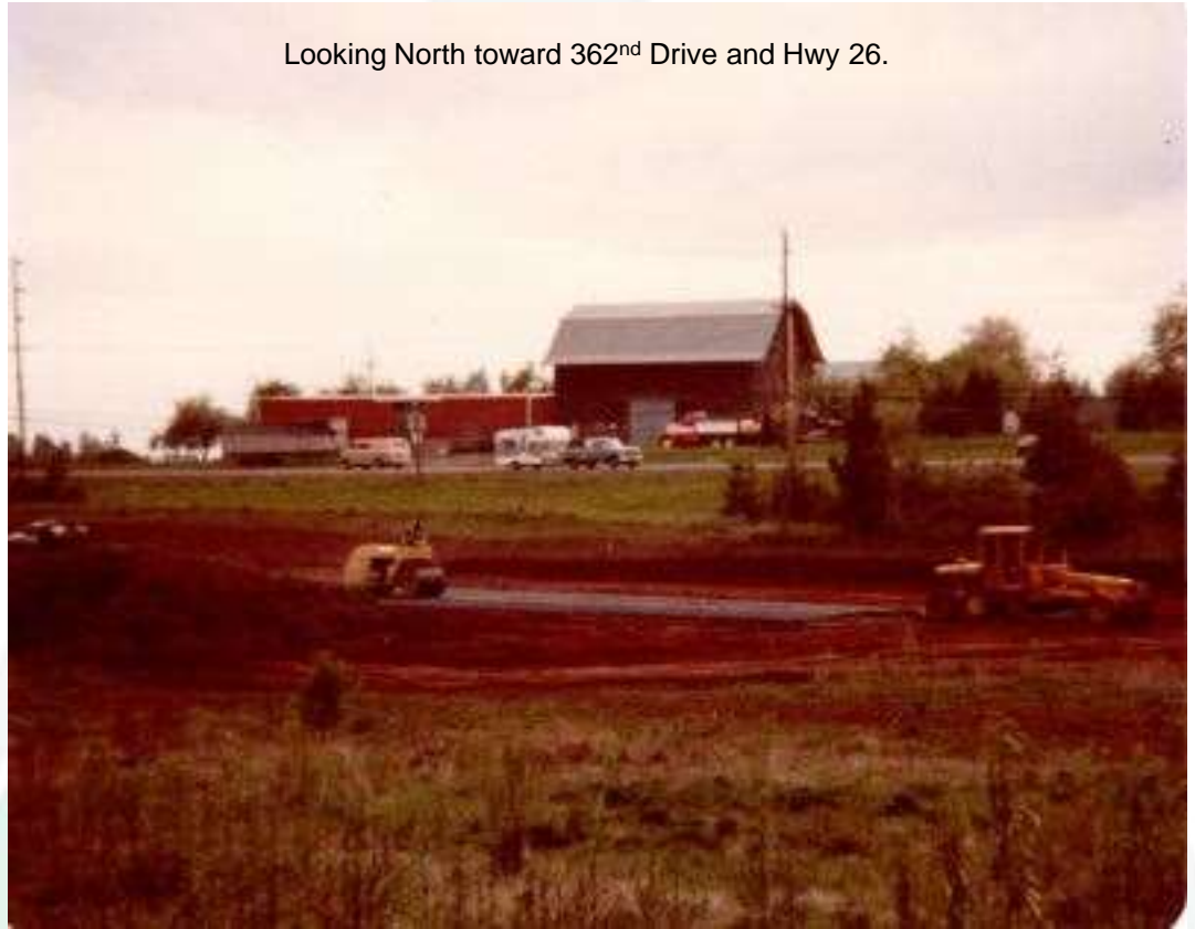
Looking North toward 362 nd Drive and Hwy 26.