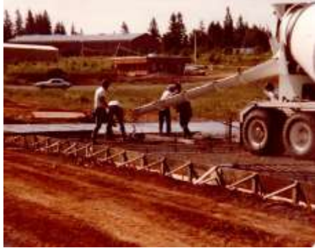
Looking East toward School District Office Building