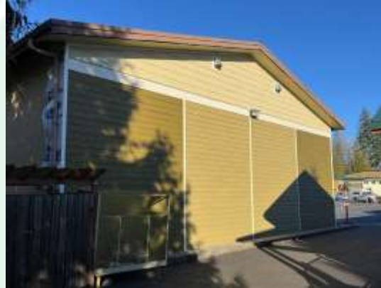
Paleo Building South Elevation