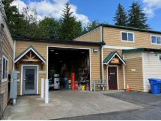
Maiden Building South Elevation