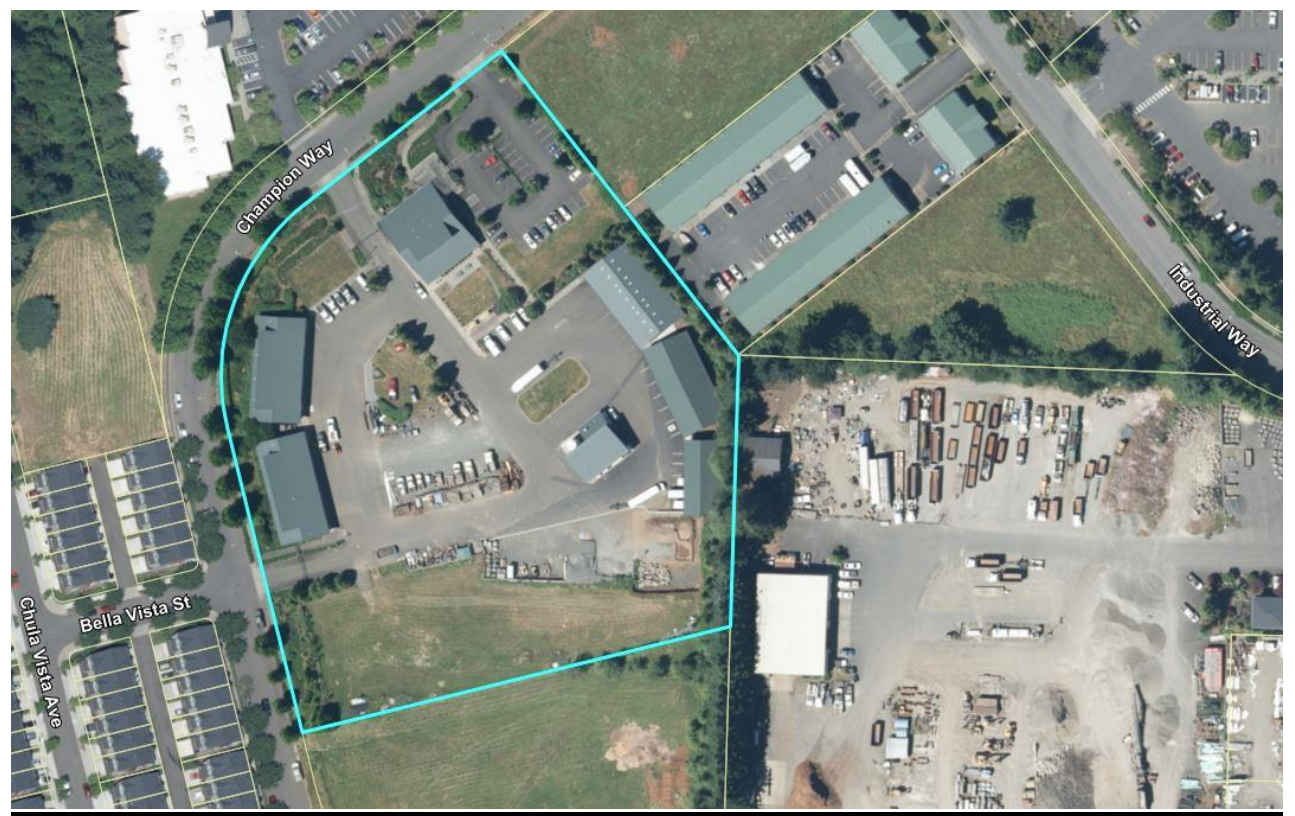
Figure 2: Ingress/Egress Drives