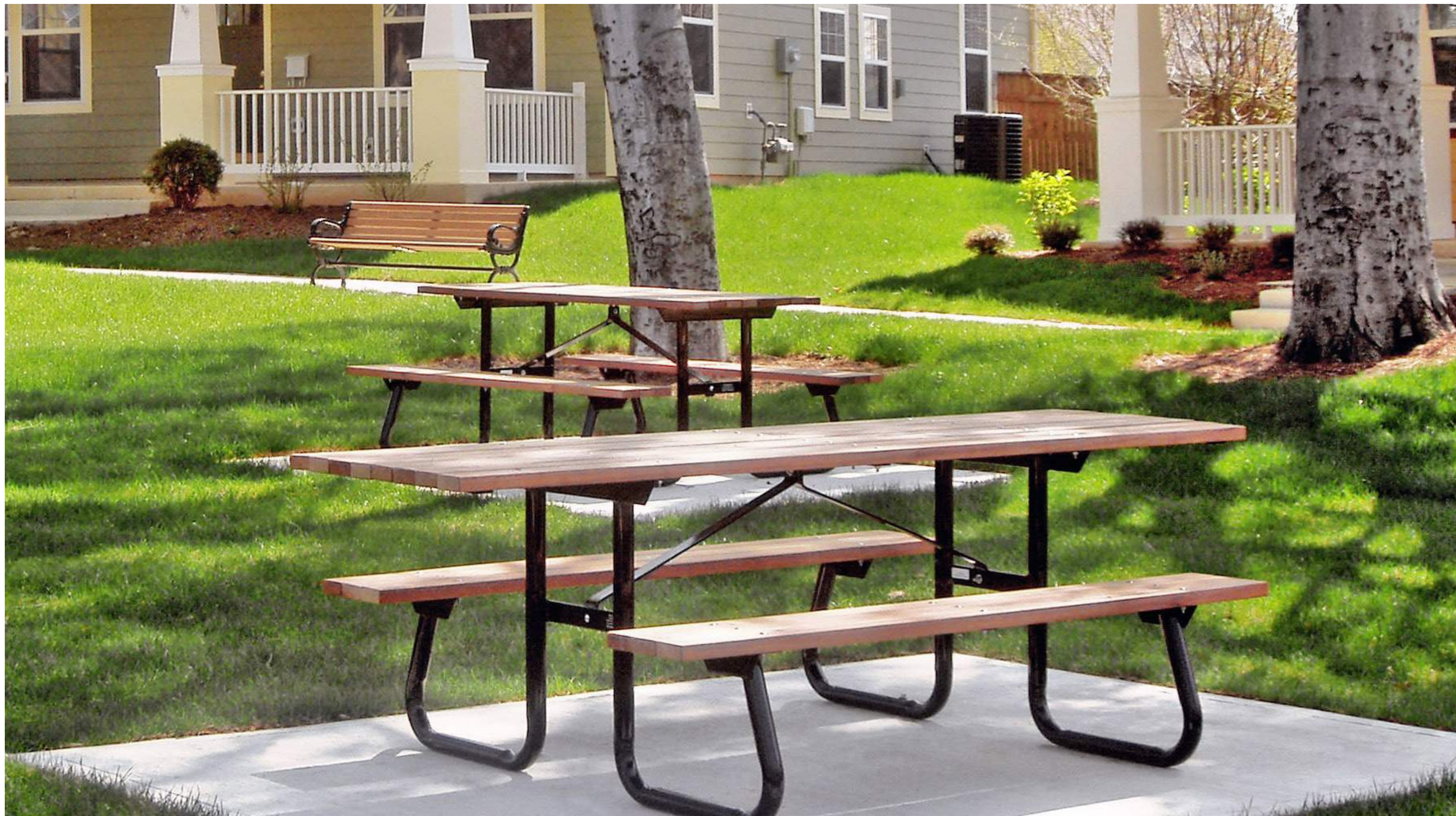
ADA and Standard Picnic Table