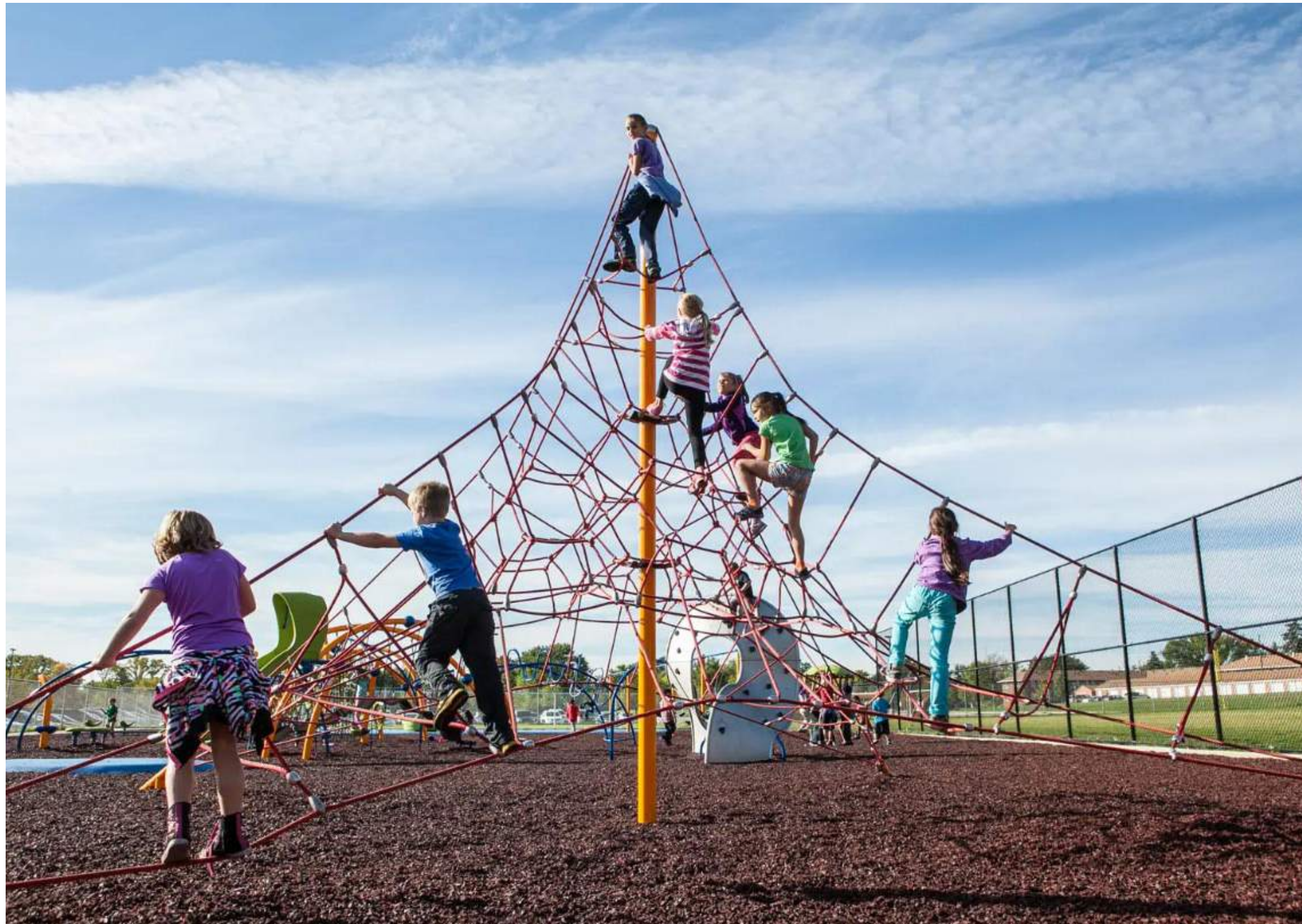
Free-standing Climbing Structure