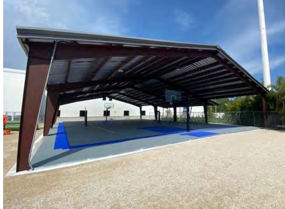
Athenian Charter School - Naples, FL