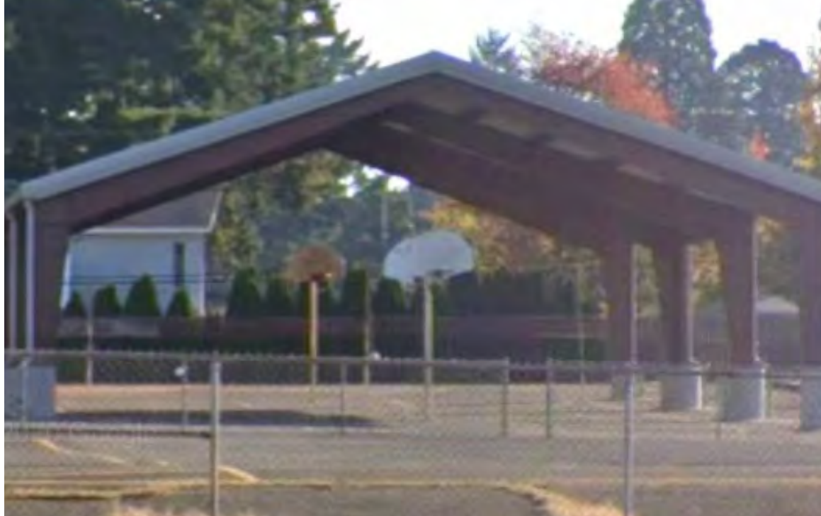
Menlo Park Elementary - Portland, OR