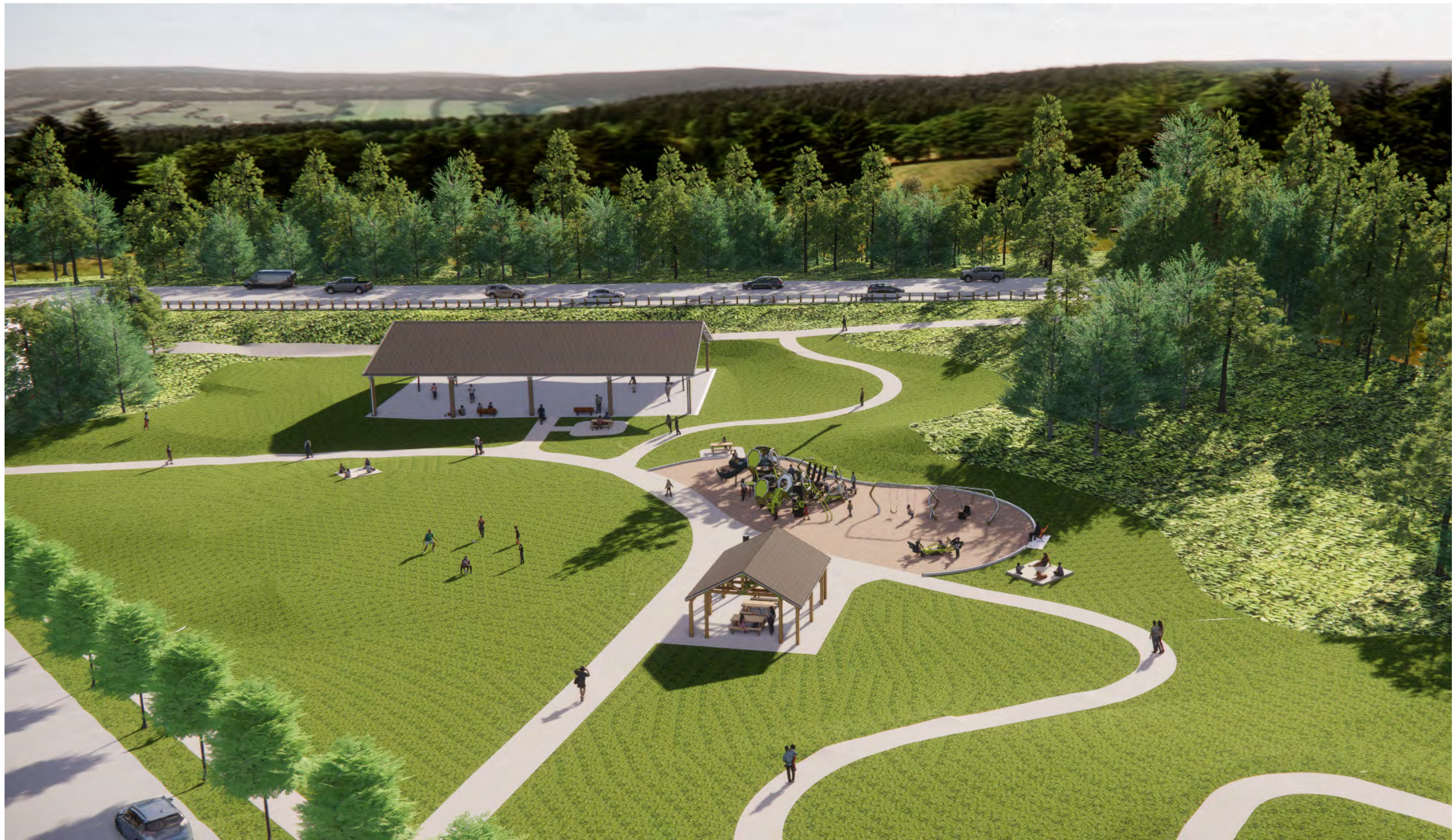
DEER POINTE PARK PERSPECTIVE