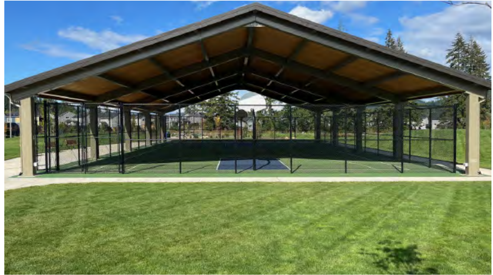
Pleasant Valley Park - Happy Valley, OR