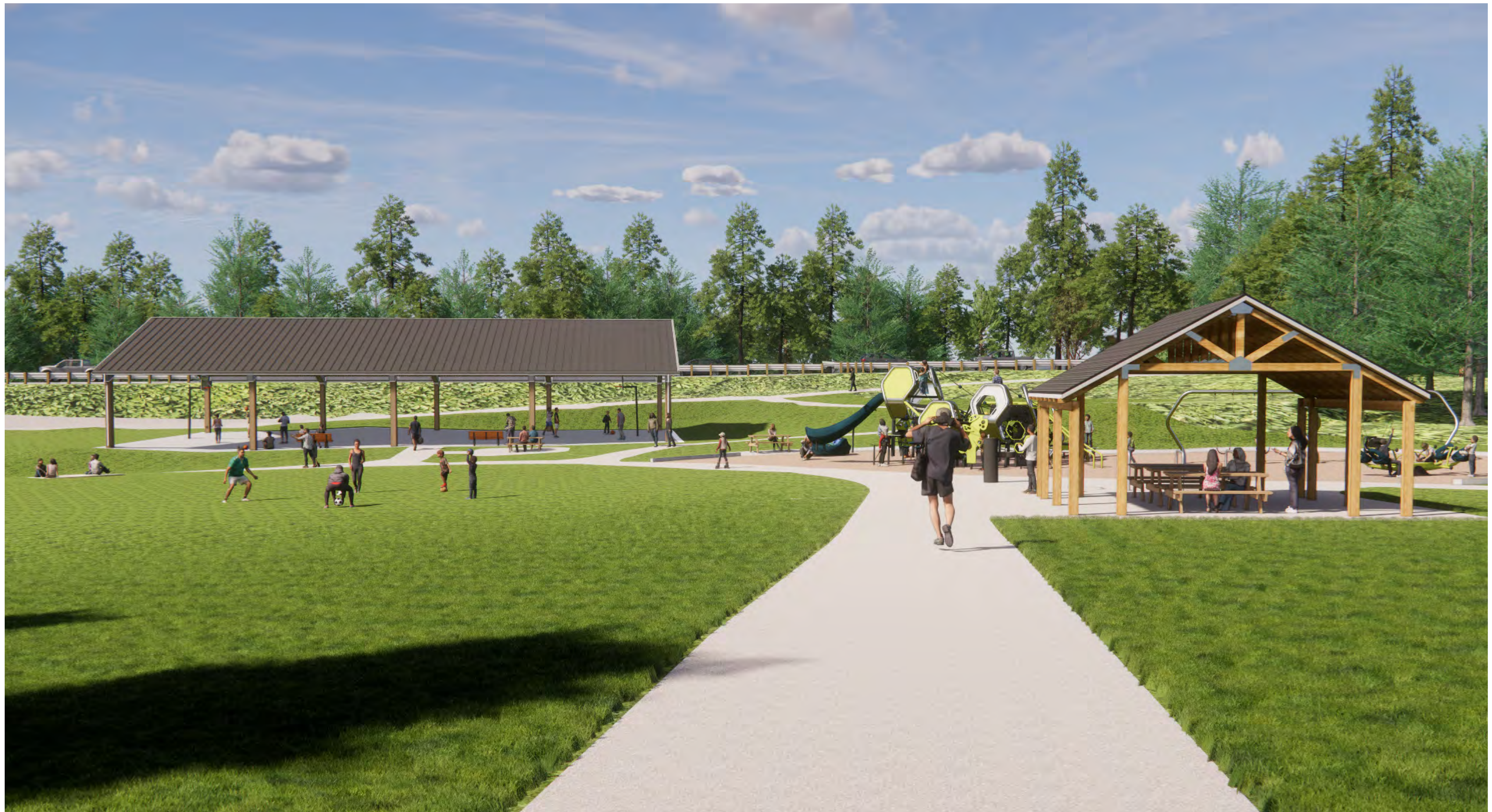
DEER POINTE PARK PERSPECTIVE