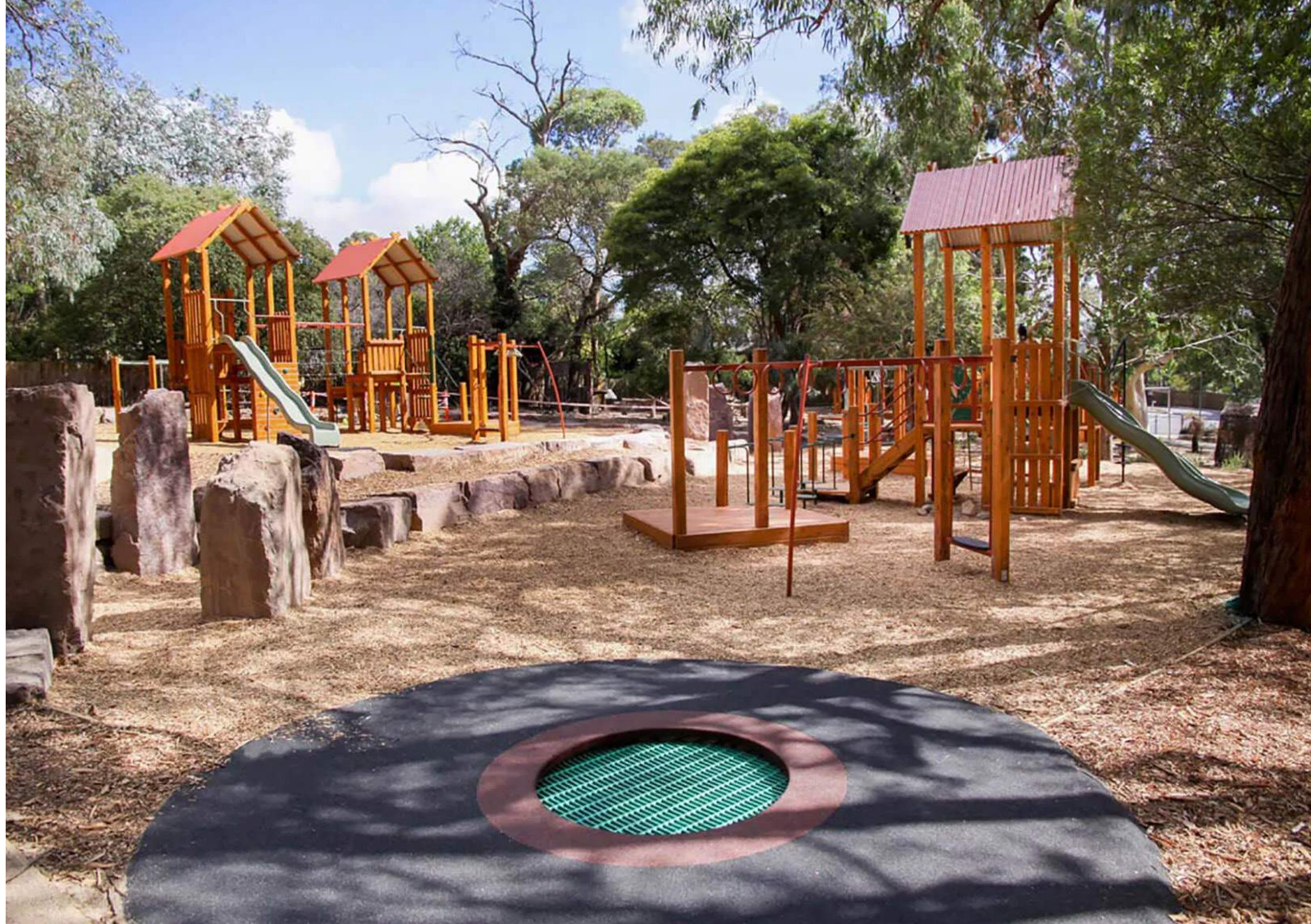
A combination of nature and modern