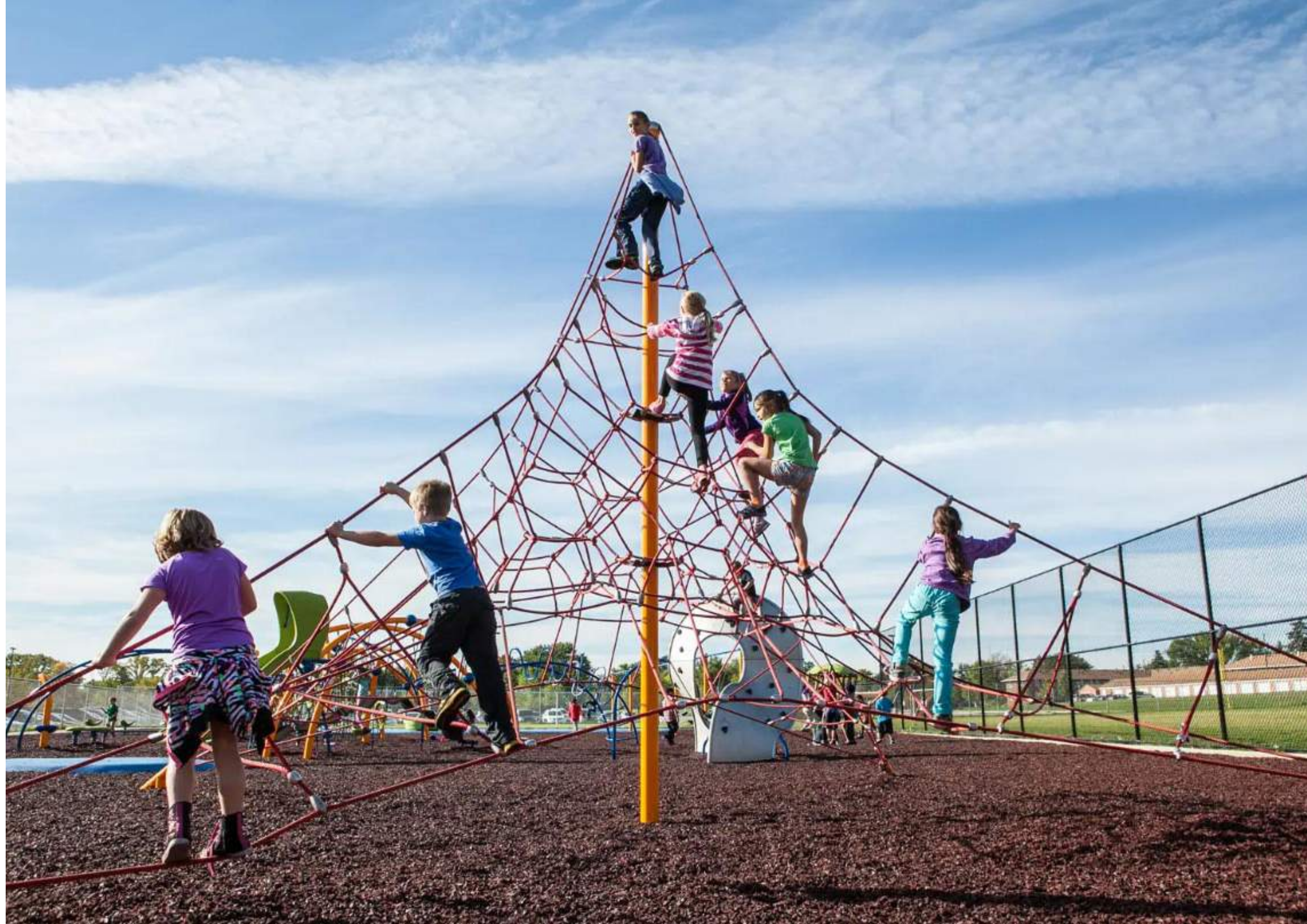
Free-standing Climbing Structure