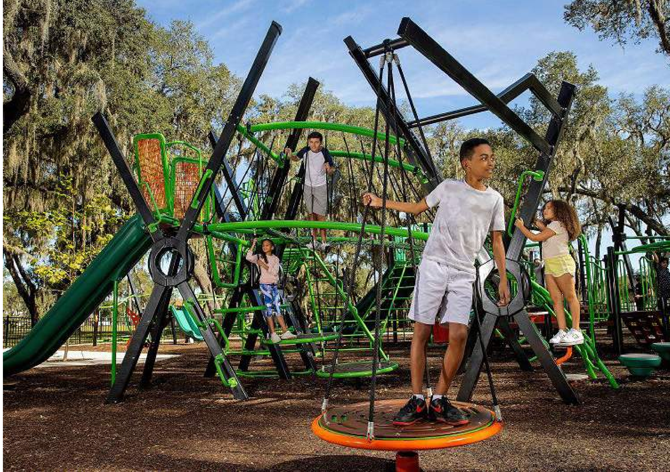
Modern Play Features