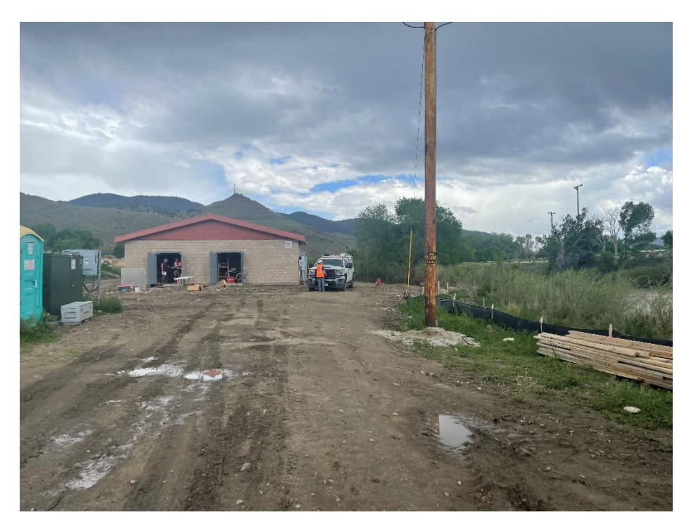
Figure 1 - Pump Station Building