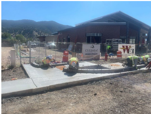
Oak Street Curb and Sidewalk Fronting Fire Station