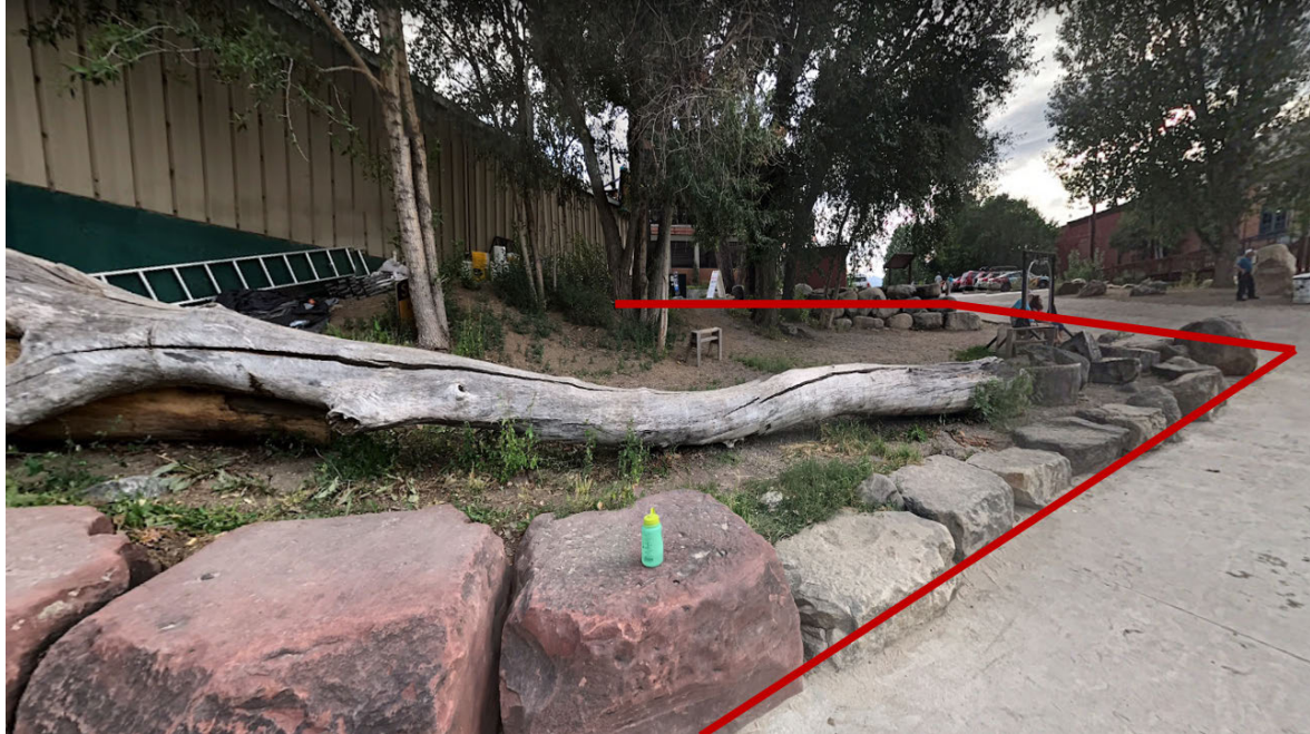
Ground-Level View (FIBArk Boathouse boundaries not pictured)

FIBArk would allow space for 3-5 vendors to set up tents and tables only (no vans, small trailers maybe) in this outdoor space adjacent to the boat ramp. Vendors would likely be local river-centric businesses, with potentially a couple food options.