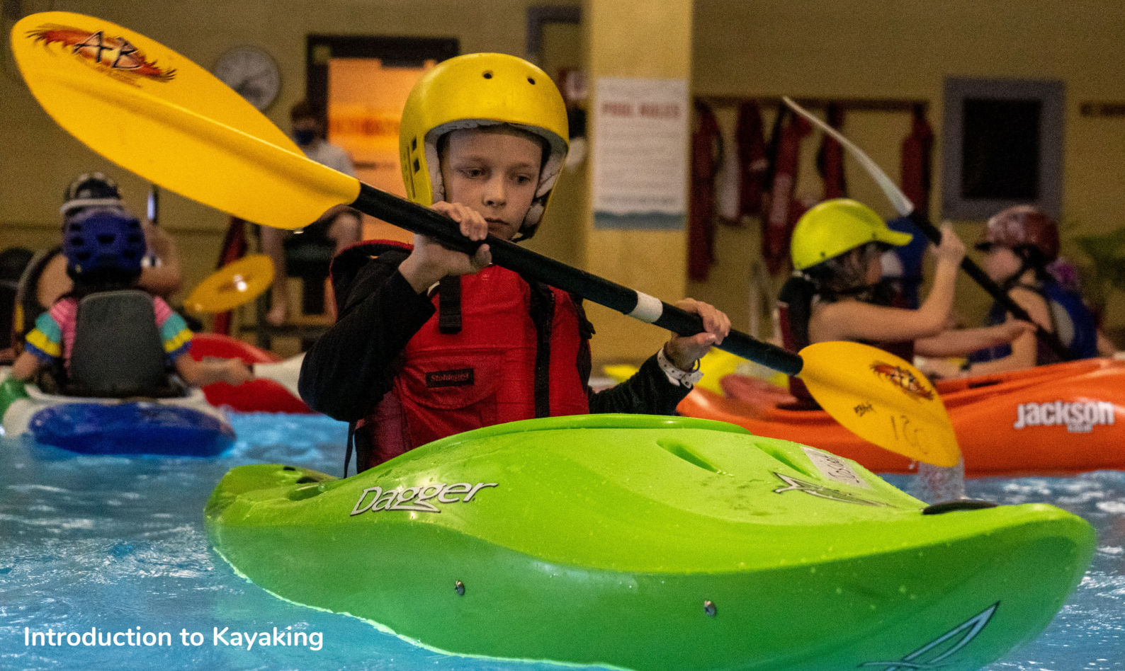
Introduction to Kayaking