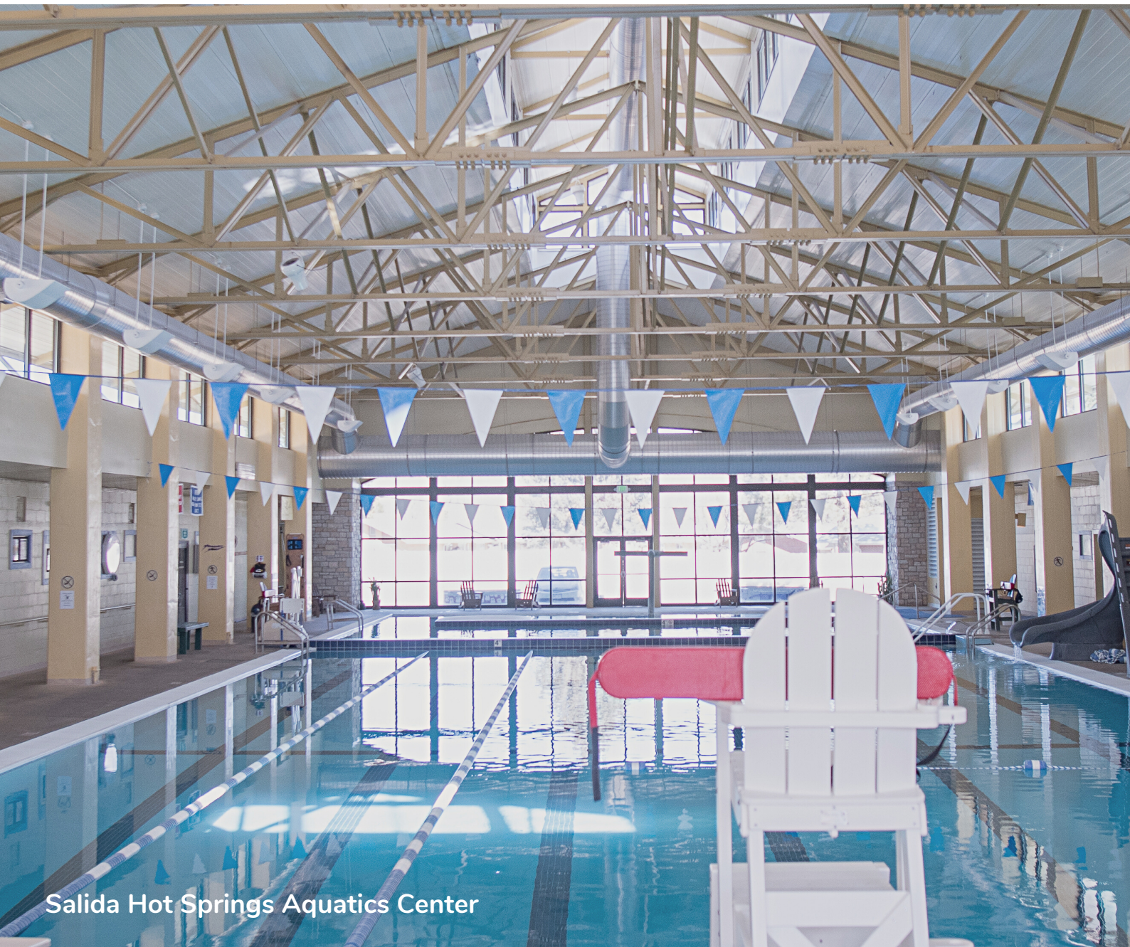
Salida Hot Springs Aquatics Center

Social Equity and Access are very important aspects of Parks and Recreation and the City of Salida Parks and Recreation Department will continue to work on and improve access to parks and programming into the future.