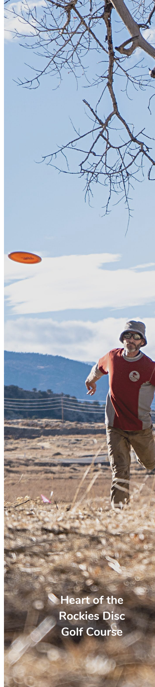
Heart of the Rockies Disc Golf Course