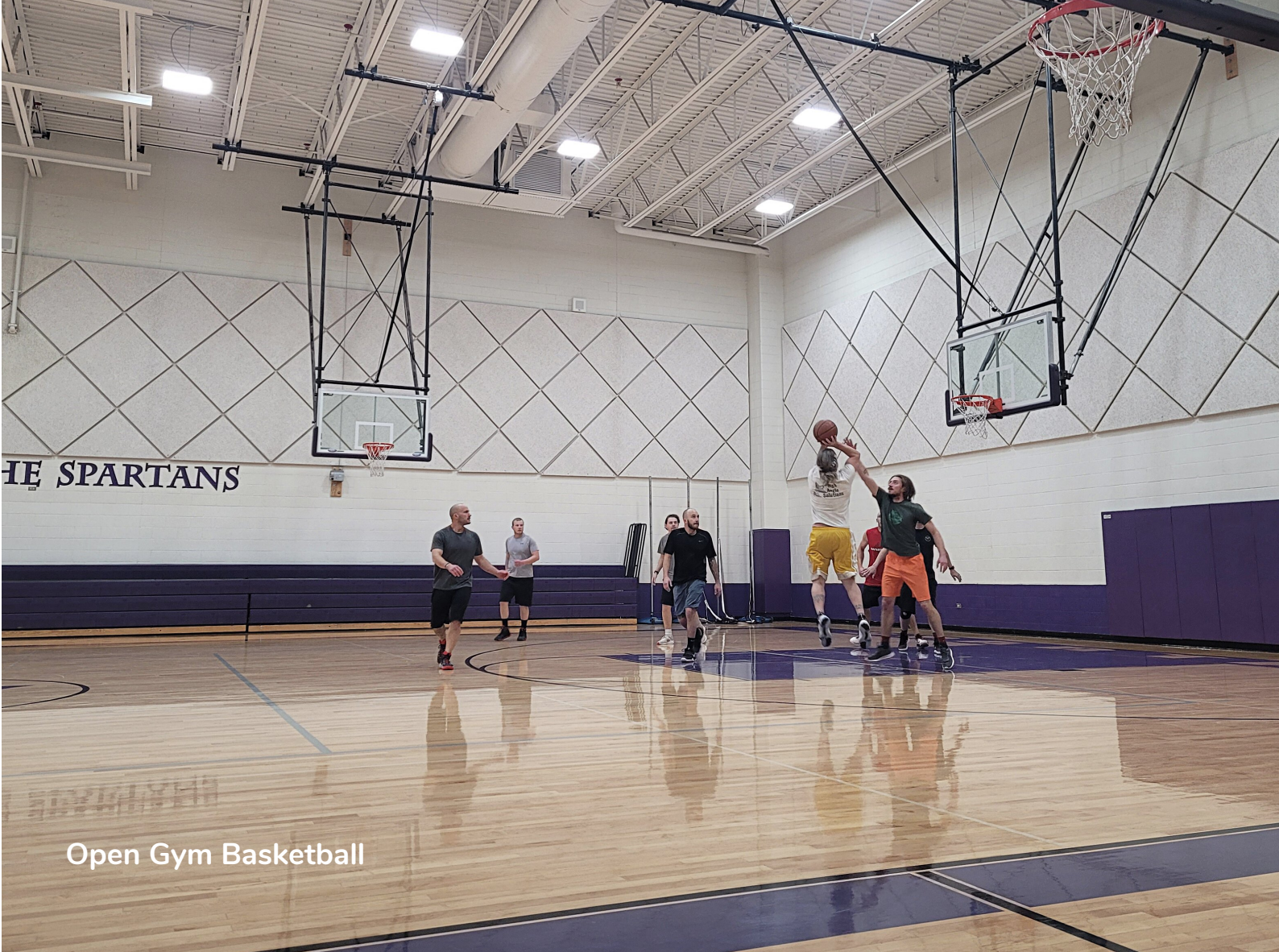
Open Gym Basketball