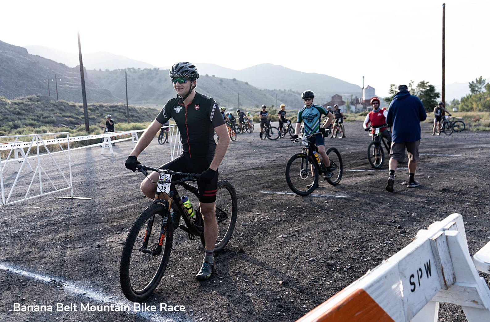
Banana Belt Mountain Bike Race

Our Parks crew has spent 2021 improving current assets and maintaining the city's current parks for people to enjoy. Under the guidance of the new Parks Manager, and more staffing, the parks saw a greater level of attention making sure that they were clean and well kept for everyone to use. Mowing, trash collection, field upgrades at Marvin Park ball fields, and other maintenance were performed to a high standard that we are excited to continue into the future.