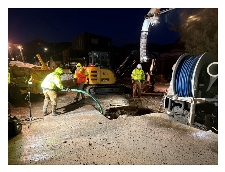
Figure 2 - Emergency Water Main Repair Downtown