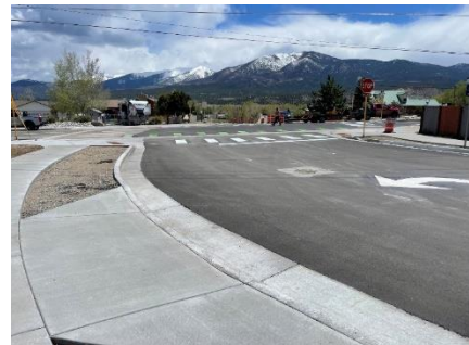
Poncha Blvd and Holman Reconstruction