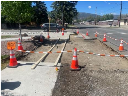
Staff Improving Accessible Drop Off Zone at School