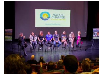
Salida Film Festival