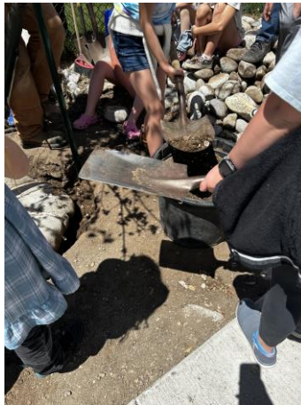
Arbor Day: Filling in the hole for the Boxelder Tree