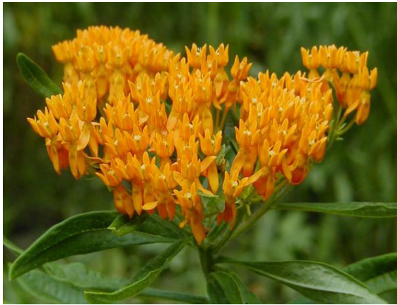
Asclepias tuberosa butterfly weed