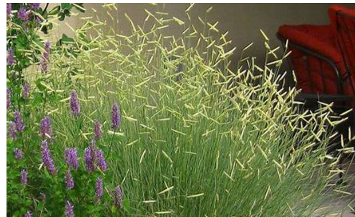
Bouteloua gracilis Blue grama