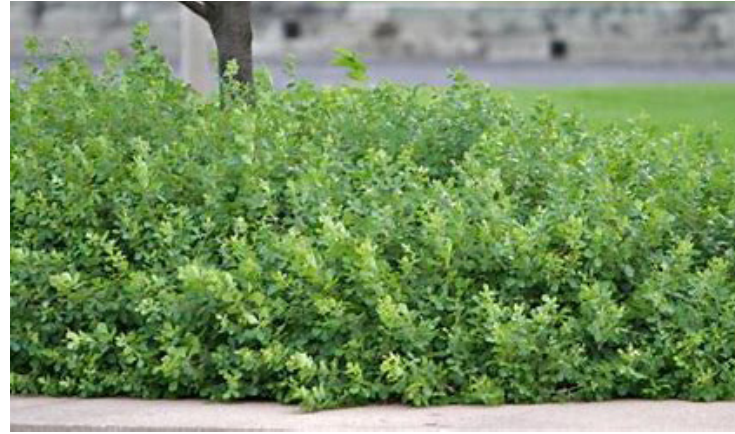
Rhus aromatica 'Gro Low' 'Gro Low' fragrant sumac