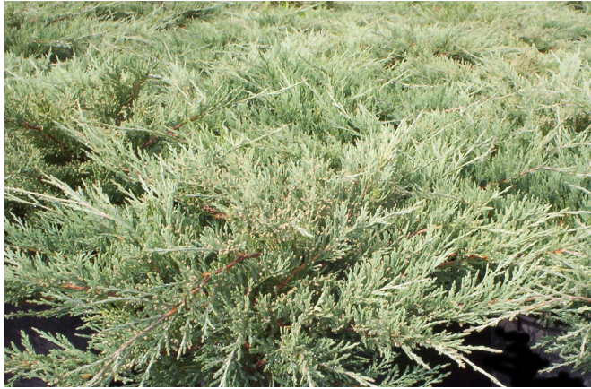
Juniperus horizontalis creeping juniper