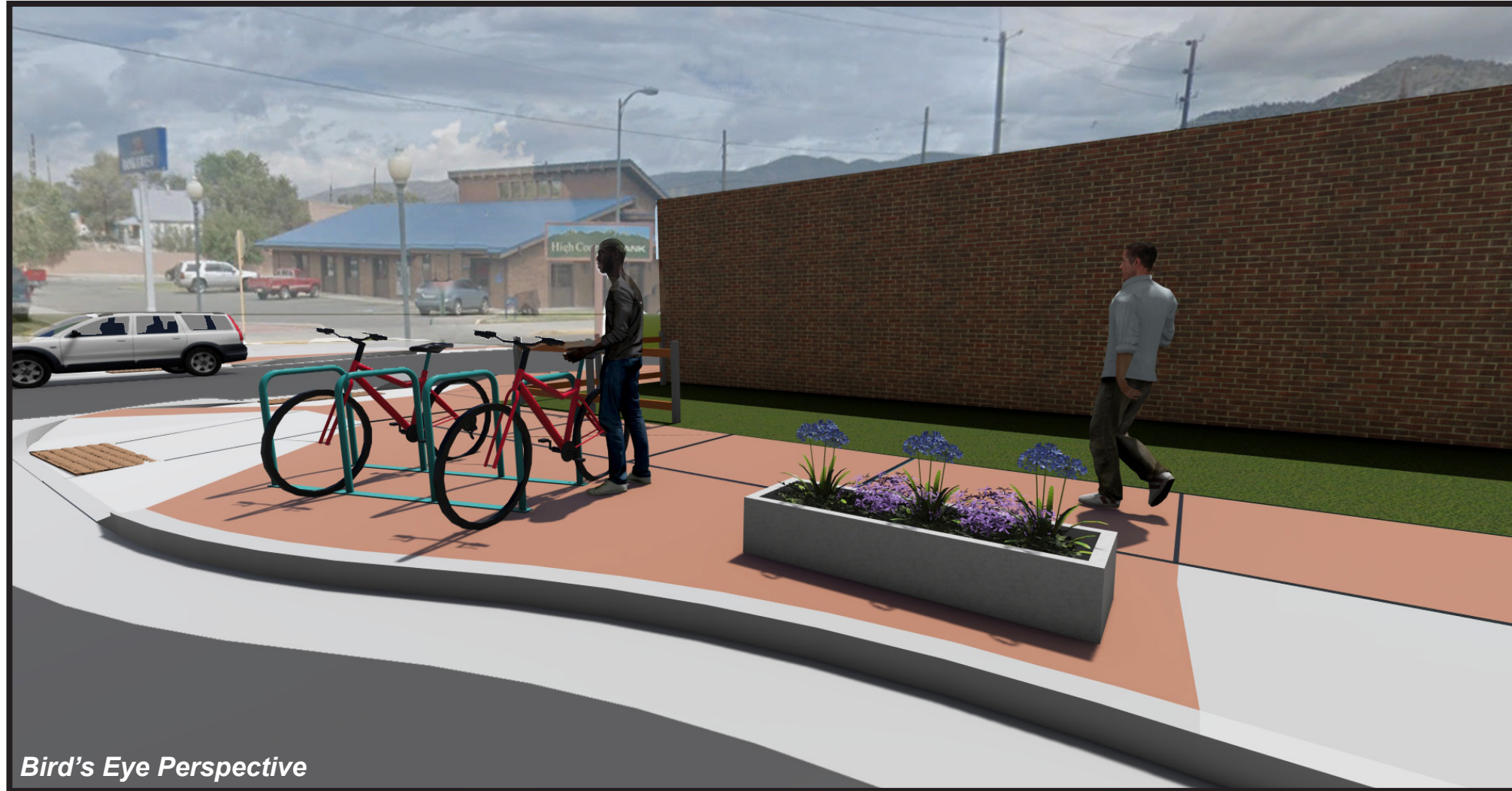
Bird's Eye Perspective