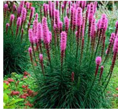
Liatris spicata spike gayfeather