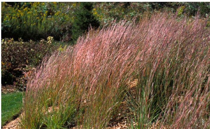
Schizachrium scoparium little bluestem