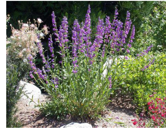
Penstemon strictus Rocky Mountain Penstemon