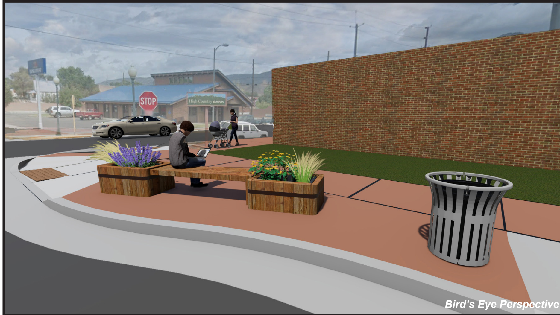
Bird's Eye Perspective