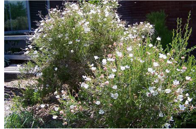
Fallugia paradoxa Apache Plume