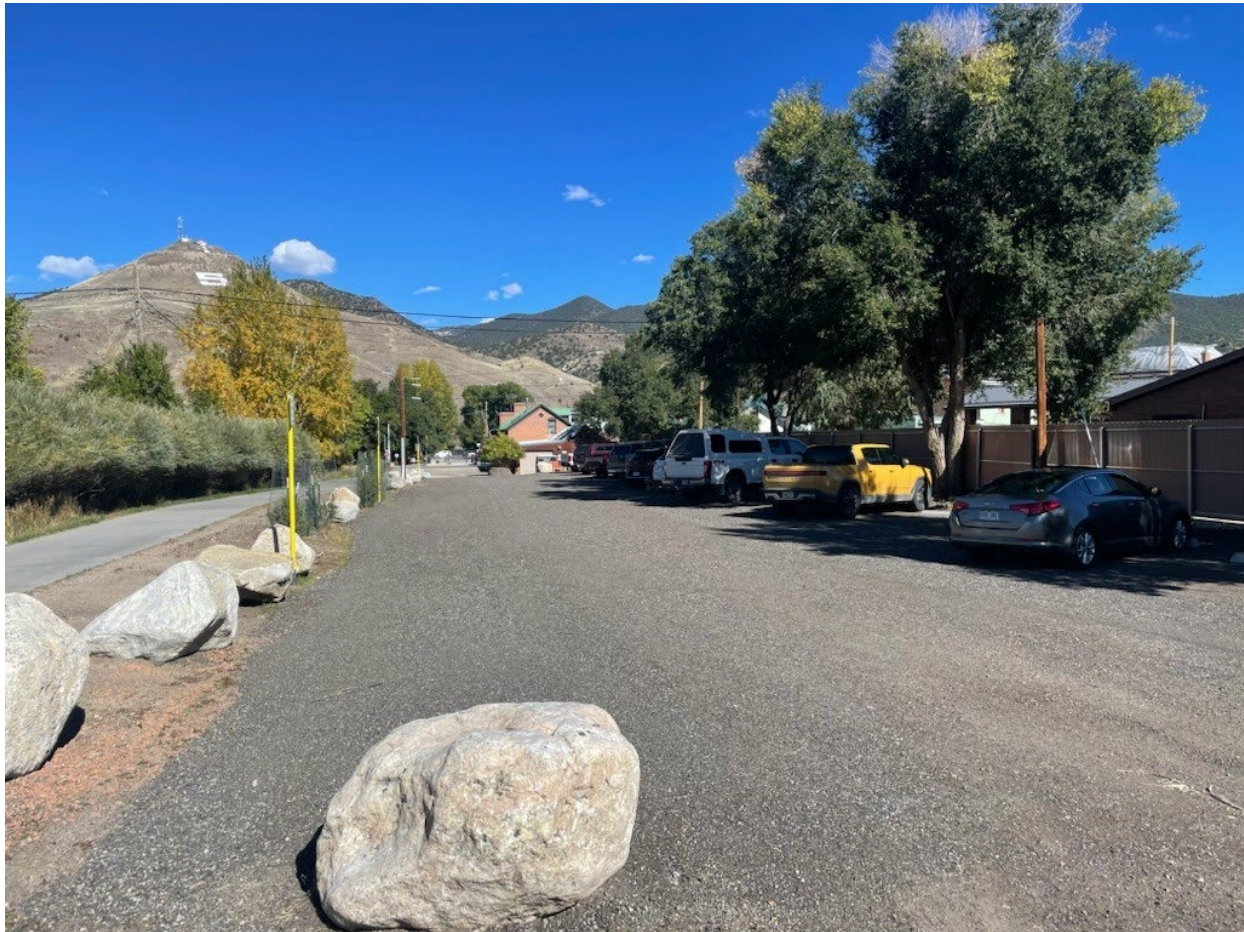
Figure 2: Leased Parking Lot Behind Bank of the West/Green Cat Gallery

vehicles and trailers. The owners originally desired to enter into the lease as a “trial run” and agreed to provide notice as to whether they would renew the lease by the end of February 2024. The lot has since been improved with boulder fencing, signage, gravel surfacing and concrete wheel stops, as well as a privacy fence for the gallery, as requested by the owners (total cost approx. $10,000). In January 2024, the owners sent notice that they are interested in renewing the lease for a 2-year period spanning May 1 st , 2024 through April 30 th , 2026. The owners stated that they did not want to commit to more than two years at this time. The cost of the lease is $20,000 per year (up from an original amount of $15,500/year, pro-rated). Staff is requesting Council’s approval of the new commercial lease agreement.