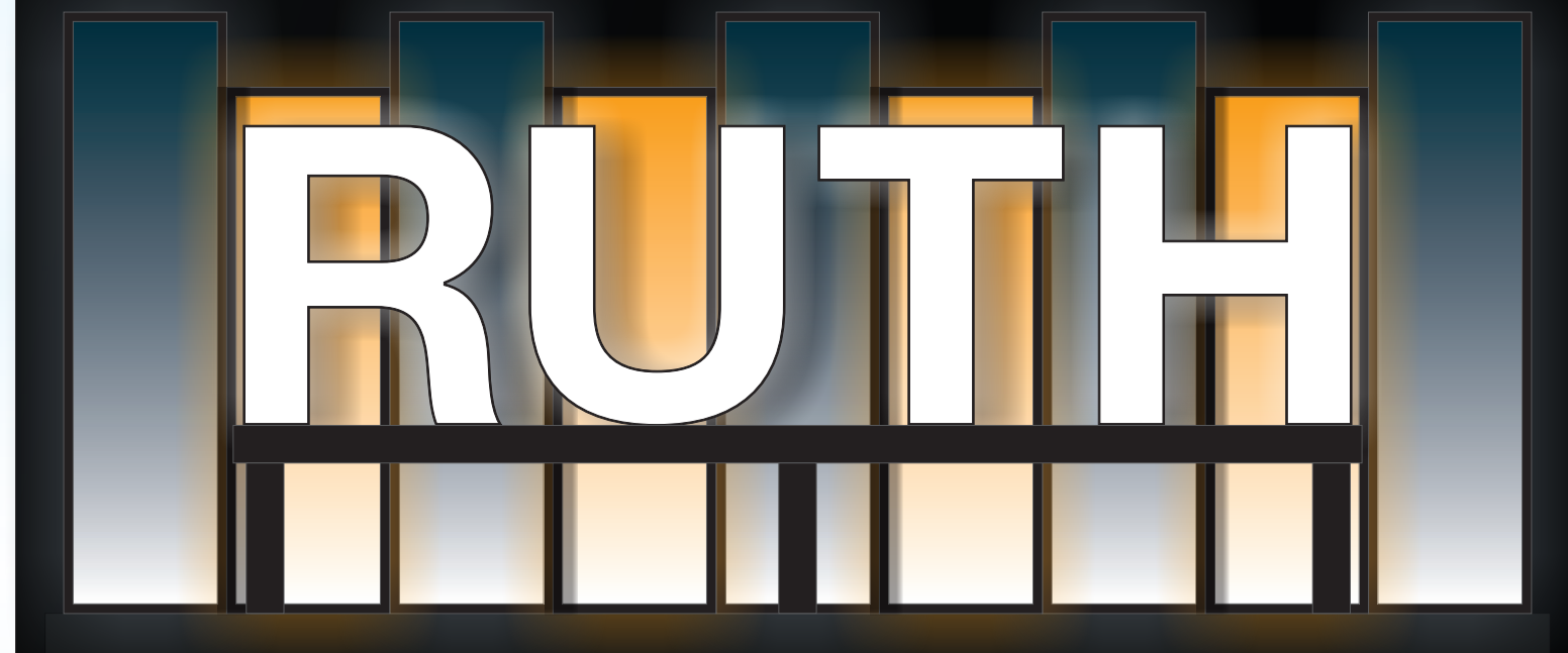
SIMULATED NIGHT VIEW