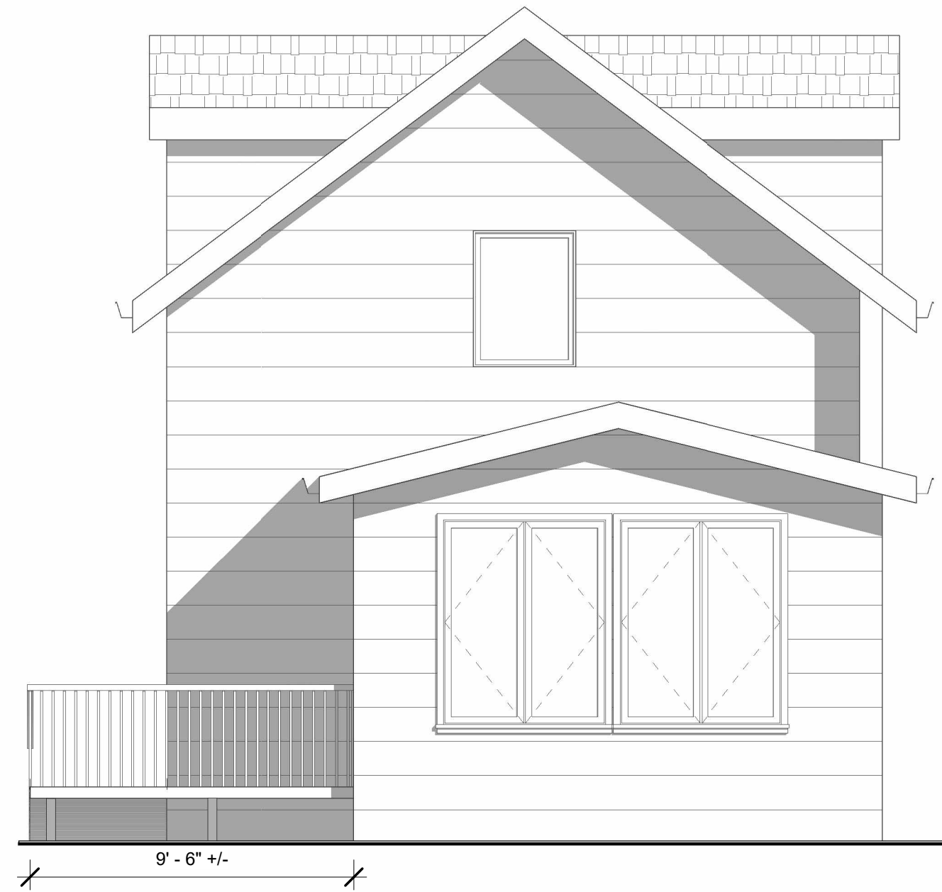
3 WEST ELEVATION 1/4" = 1'-0"