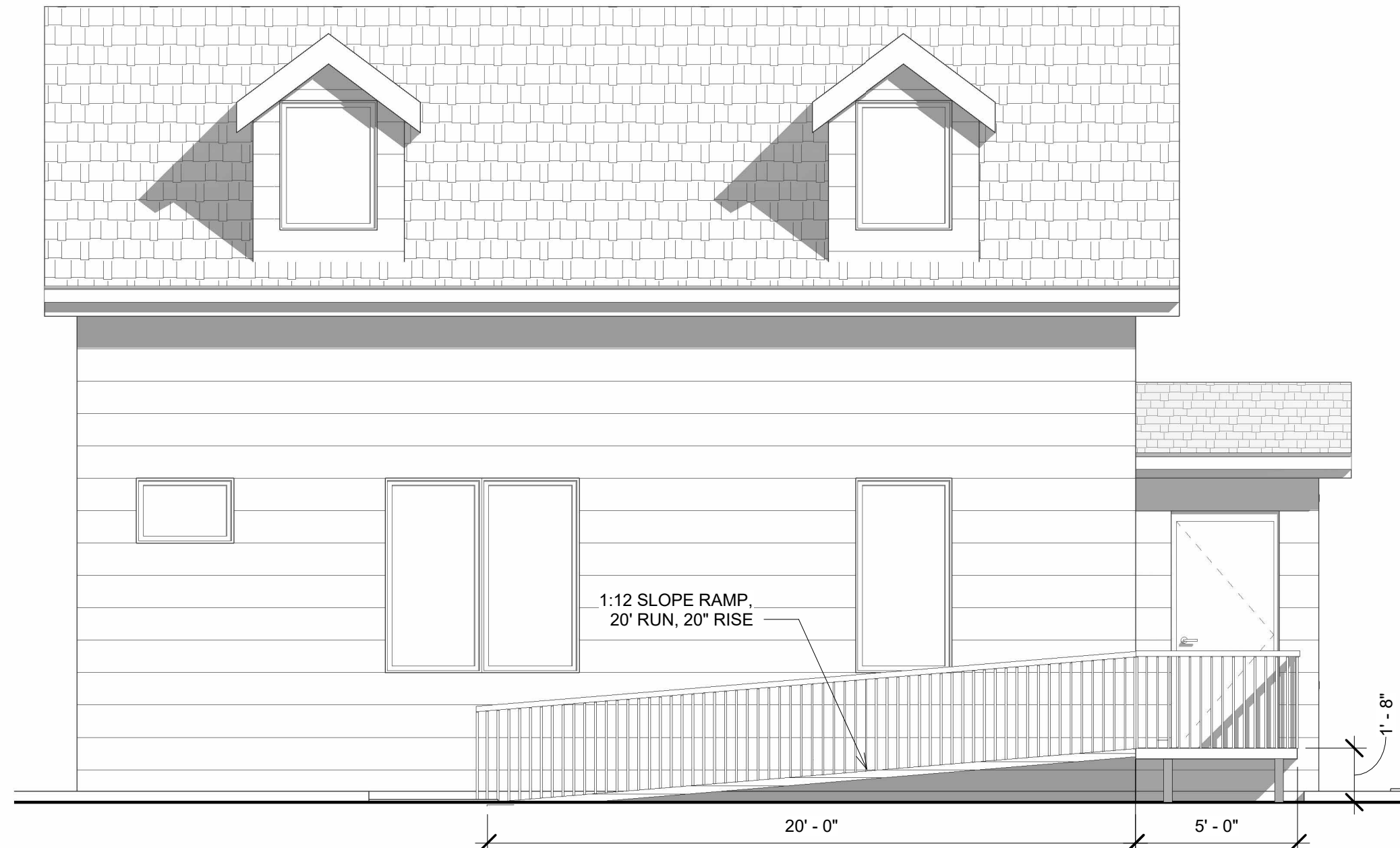
2 NORTH ELEVATION 1/4" = 1'-0"