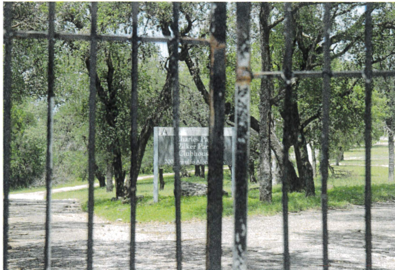
The city closed the Zilker Clubhouse area and increased security around the facility after recent break-ins and vandalism.