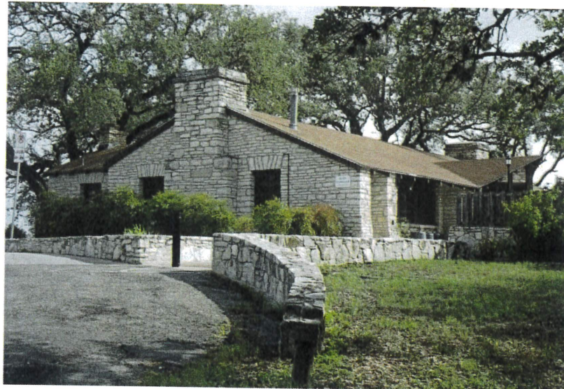
The historic Zilker Clubhouse is undergoing a $6 million project for facility improvements and security upgrades.