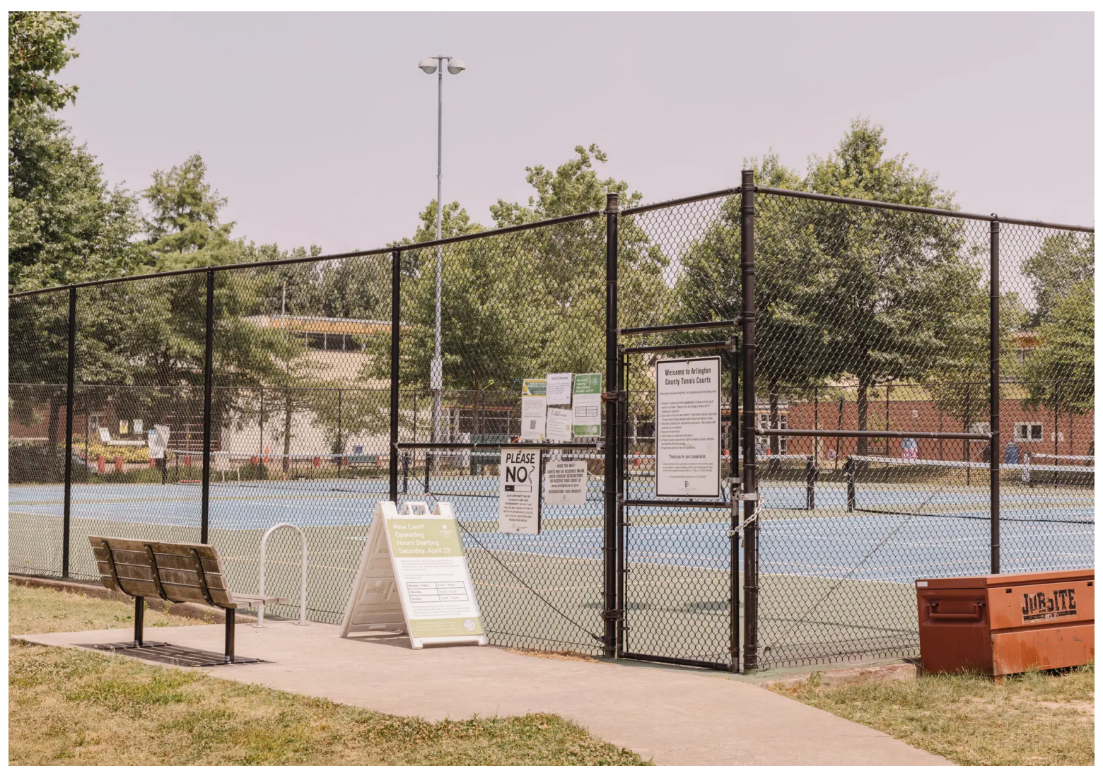
The tennis courts at the Walter Reed Community Center are now primarily used for pickleball, allowing six games to happen simultaneously.