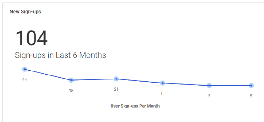
Figure 2: New EyeOnWater enrollments per month, October 2024 through March 2025

Included as attachments to this agenda item are a proposed utility bill insert and a proposed leak alert letter. The proposed utility bill insert is intended as a way to inform utility customers of the potential for cost savings on insurance rates, and as a way of notifying them of the recent changes to the leak adjustment policy. Should a customer then request written confirmation from the City that their property's water meter provides leak alerts, the proposed leak alert letter, which has been approved by Mayor Massingill, would become the template for such a letter.