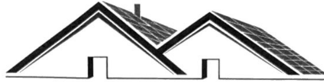
EXHIBIT B (Developer Project)

MARTINEZ ROOFING — & HOME IMPROVEMENTS, LLC —