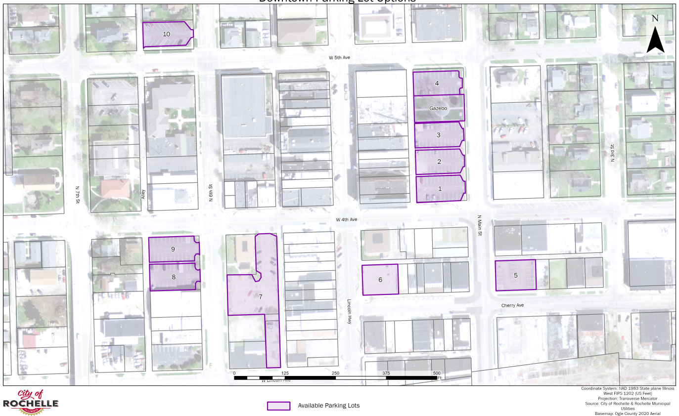
Downtown Parking Lot Options