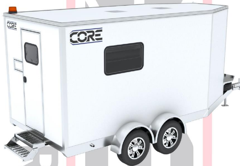
7015FT Exterior Shown w/ Standard Features