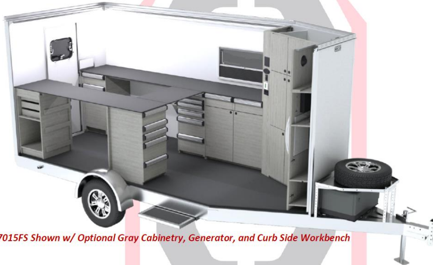
7015FS Shown w/ Optional Gray Cabinetry, Generator, and Curb Side Workbench

24094 MN HW-22, Litchfield, MN 55355 | info@intelli-core.com | 320-298-1600