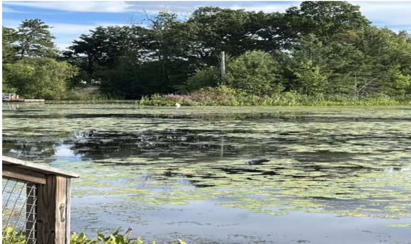
Powers Farm Norroway Pond