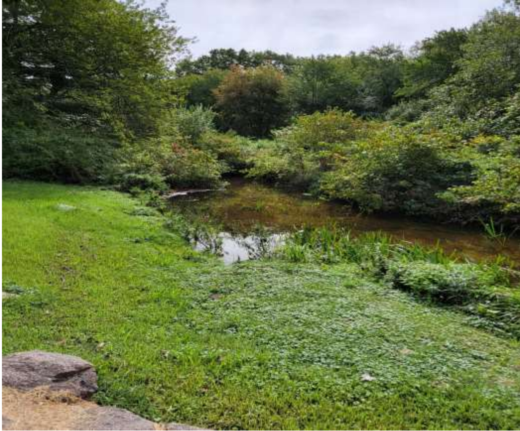
13 Regina Rd Backyard