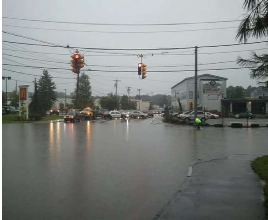
Warren St & Highland Ave 2012

Benefits: Human Safety, Protect Property and Meet Stormwater Requirement Measures