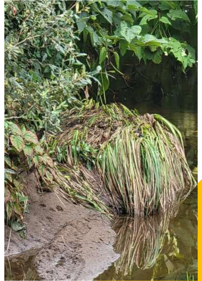
A picture story of Glovers Brook September 2025