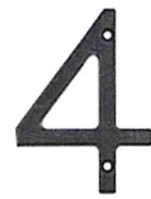
4 In. Contemporary House Number 4 Product # 36504 Finish: Matte Black