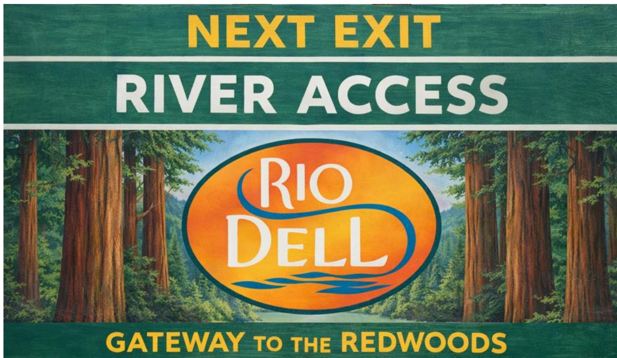
Chamber's Original Proposal

By consensus, the Council directed staff and the Chamber to return with one revised design concept based generally on the preferred concept presented in the agenda packet, narrowed to three primary features: River Access, Fuel, and Dispensary.