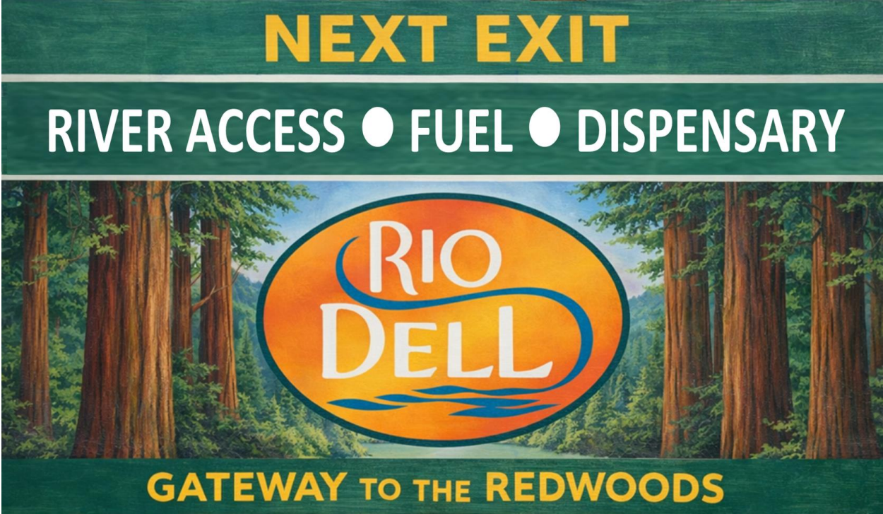
Staff Alternative 1