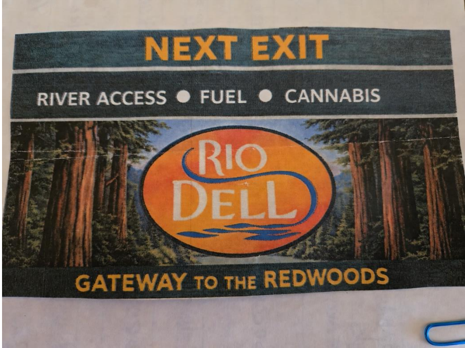
Chamber's Alternative 2