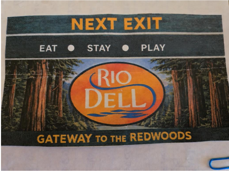
Chamber's Alternative 3