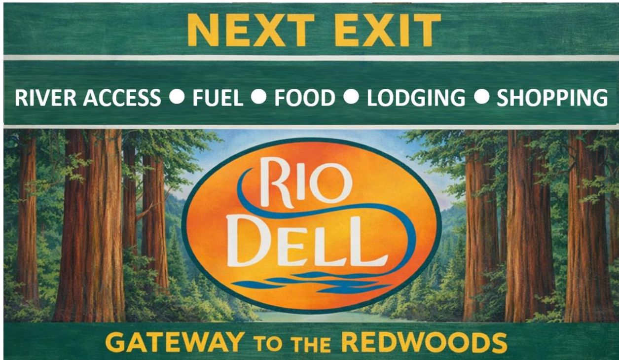
Staff's Original Alternative Proposal