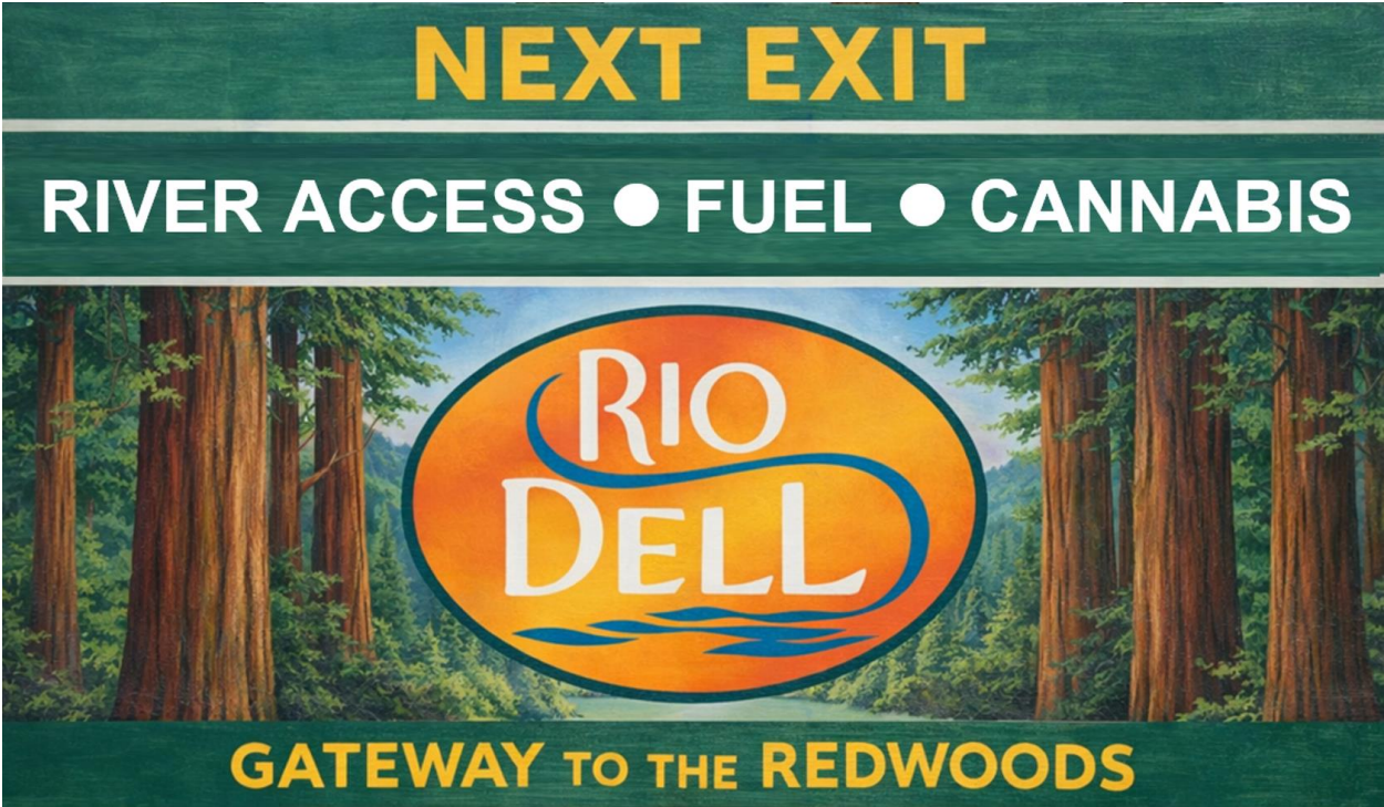
Staff Alternative 2