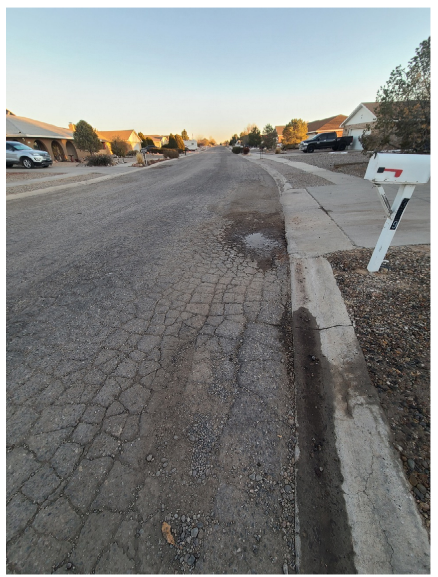
Figure 3: Alligator cracking