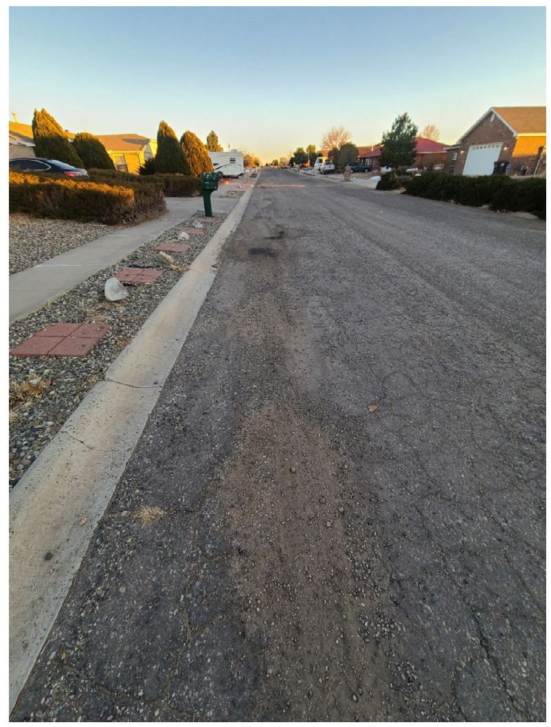
Figure 2: Excessive cracking and subgrade exposure