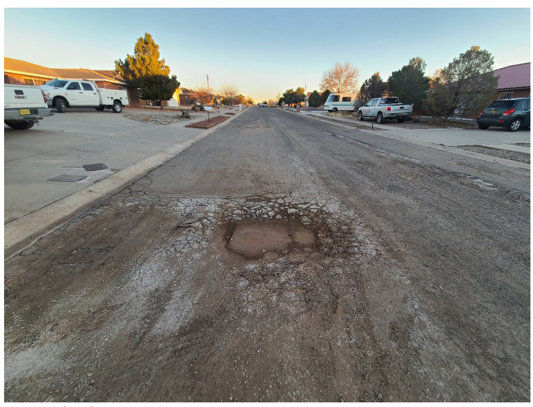
Figure 1: Subgrade exposure

A site review was performed to assess the severity and extent of material and structural distress in the existing pavement. After a careful evaluation, it was determined that the existing pavement has reached its life span and it needs immediate replacement.