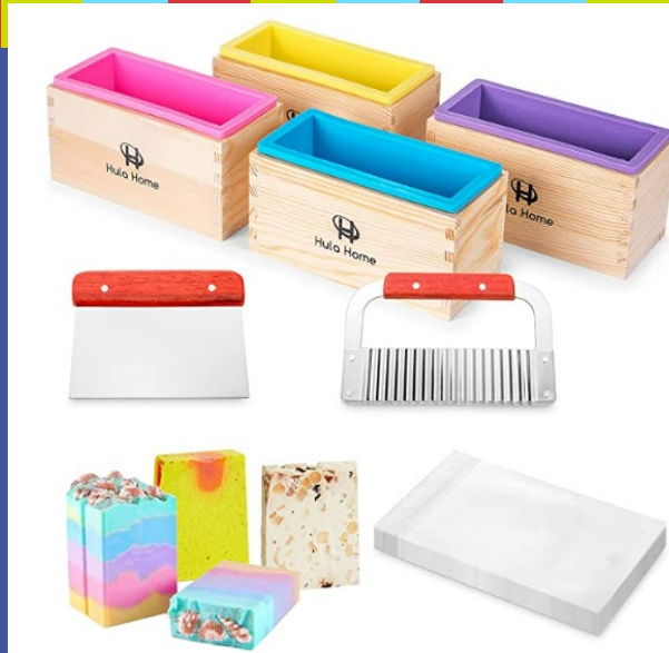
Soap and Candle Making