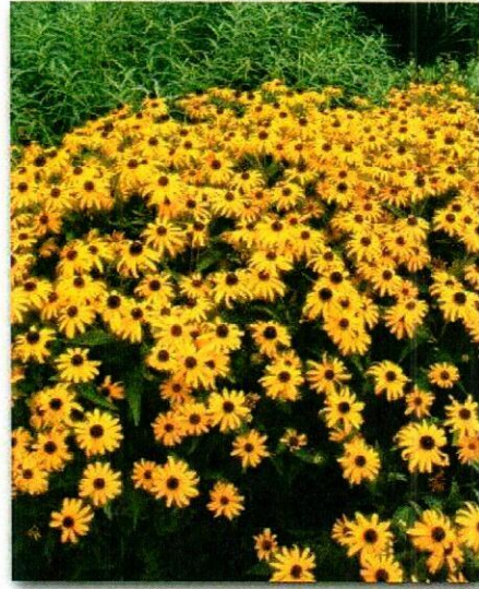
Goldsturm Black Eyed Susan