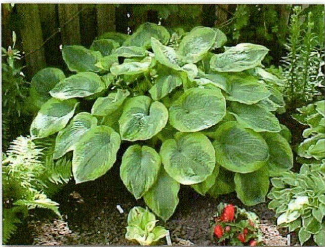
Olive Bailey Langdon Hosta