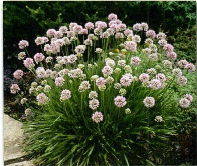
Summer Beauty Allium