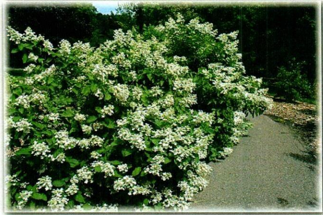
Pink Diamond Hydrangea (Spring)