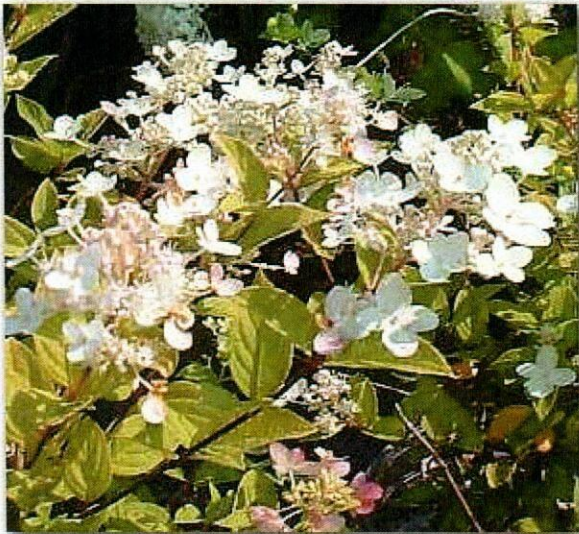
Pink Diamond Hydrangea