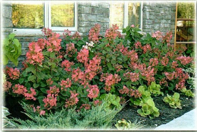
Pink Diamond Hydrangea (Fall)