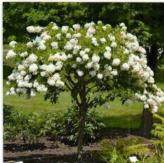
Peegee Hydrangea (TF)