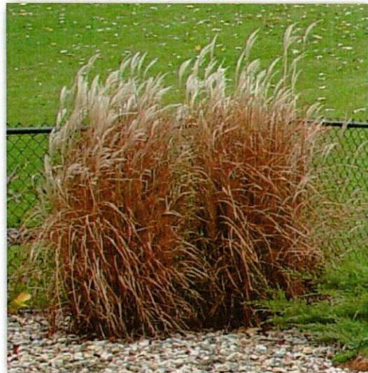
Maiden Grass (Fall)