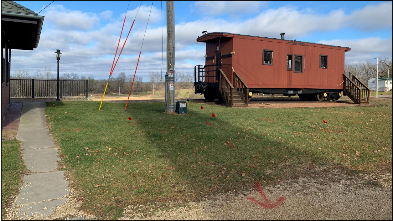
Figure 3. Location of one of the two path improvements, view north. Photo taken 11/11/22.