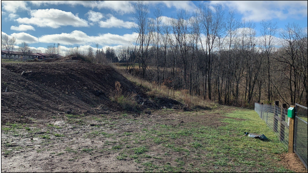
Figure 7. Area of the retaining wall adjacent to the dog park, view southwest. Note the slope and large historic fill pile. Photo taken 11/11/22.