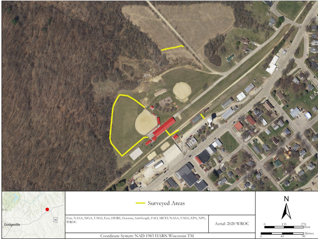
Figure 1. Map of surveyed areas on 2020 aerial.