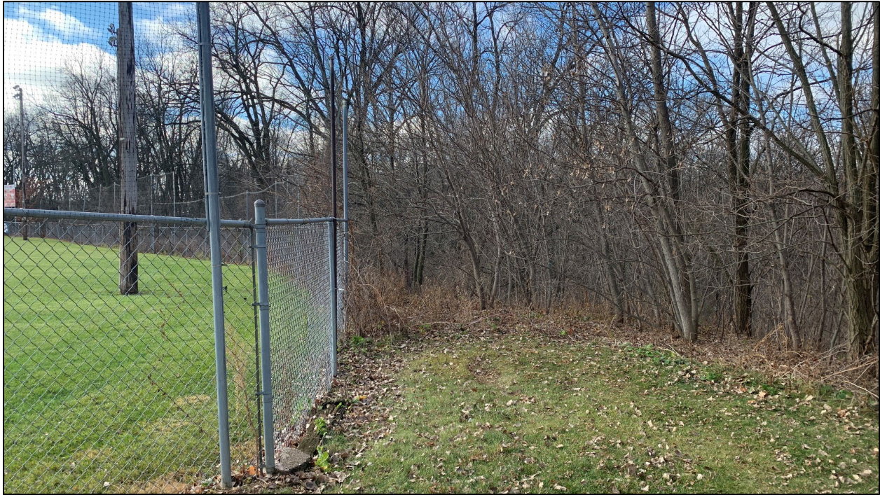
Figure 6. Northern corner of the baseball field, near the foul ball pole along the first baseline, view west. Note the drop off almost immediately adjacent to the fence in the background. Photo taken 11/11/22.