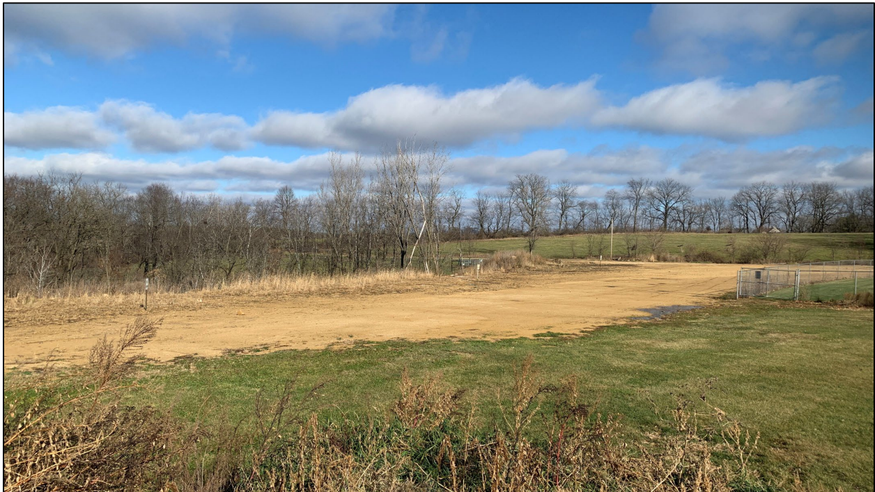
Figure 8. Photo taken from the top of the fill area located to the south of the dog park, view north. In the background the dog park is barely visible. Photo taken 11/11/22.