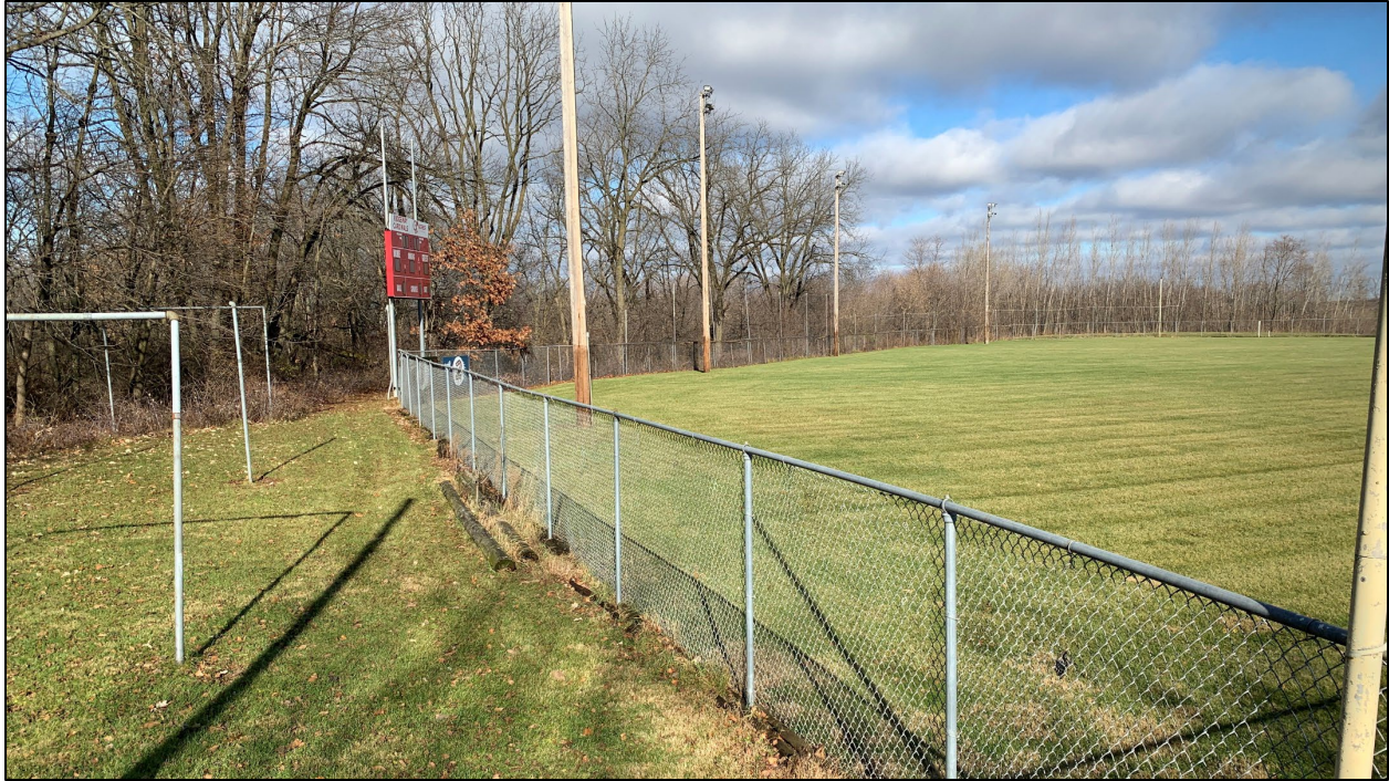
Figure 5. Southwestern corner of the baseball field showing area of shovel tests, view northwest. Shovel tests were excavated on the inside of the field due to the drop off to the north of the scoreboard. Photo taken 11/11/22.