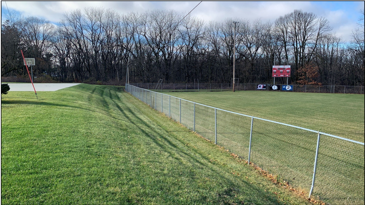
Figure 4. Southern side of the baseball field showing shaped area, view southwest. Photo taken 11/11/22.