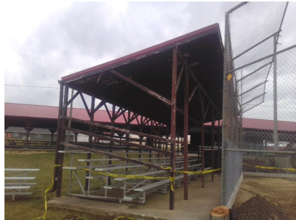
006ADD007 - Grandstand (Exterior View)