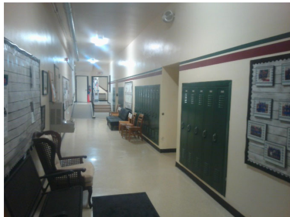
012001 - Ridgeway Community Building (Interior View 2)