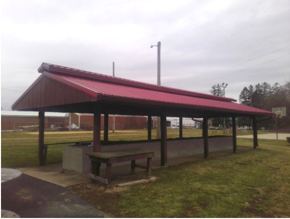
006003 - Picnic Shelter #1 (Exterior View)