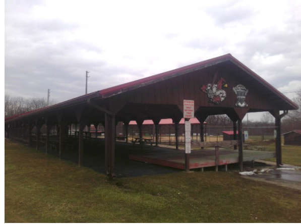
006004 - Picnic Shelter #2 (Exterior View)