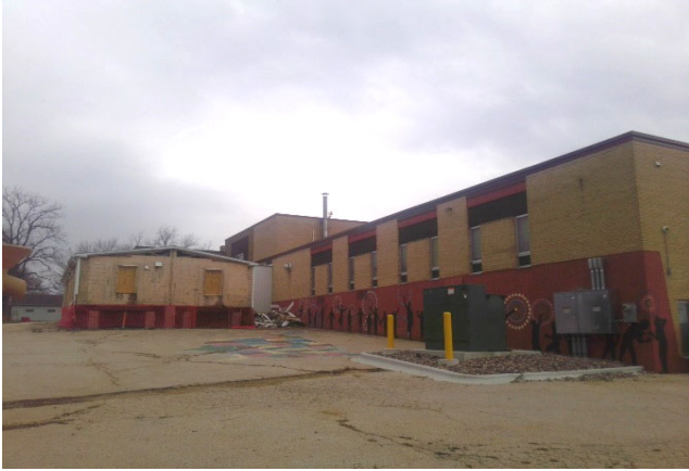
012001 - Ridgeway Community Building (Exterior Rear View)