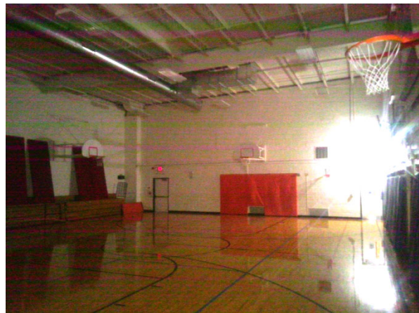
012001 - Ridgeway Community Building (Interior View 4)