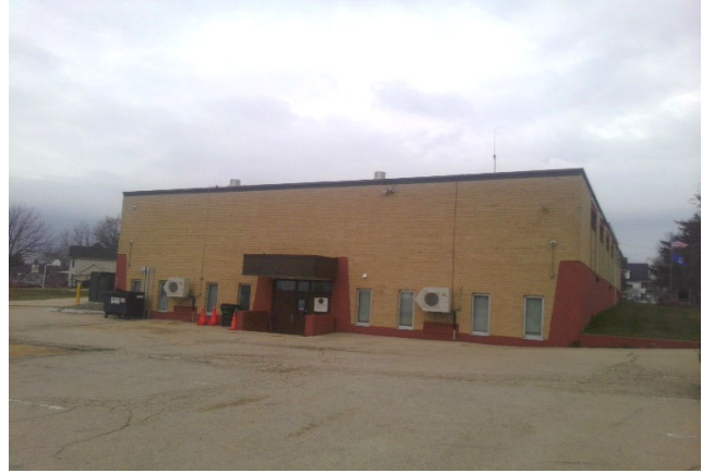
012001 - Ridgeway Community Building (Exterior Side View)