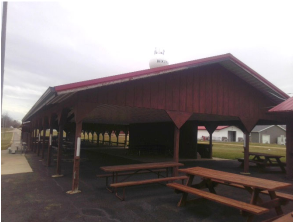
006005 - Picnic Shelter #3 (Exterior View)