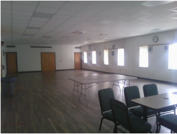
012001 - Ridgeway Community Building (Interior View 5)