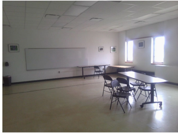
012001 - Ridgeway Community Building (Interior View 6)