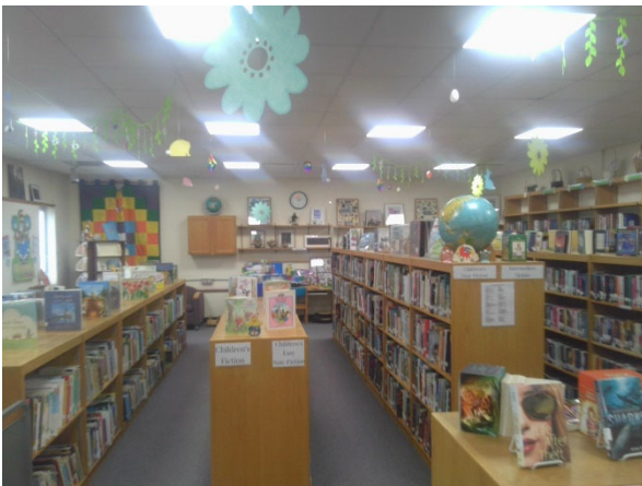
012001 - Ridgeway Community Building (Interior View 3)