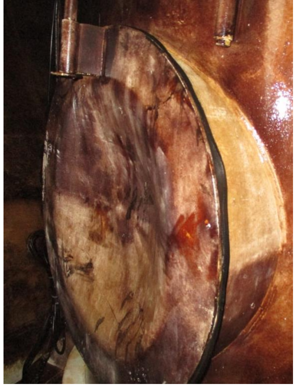
Baraboo WIDNR 5 Year Drain and Clean Out Inspection 250K Sphere – 2022