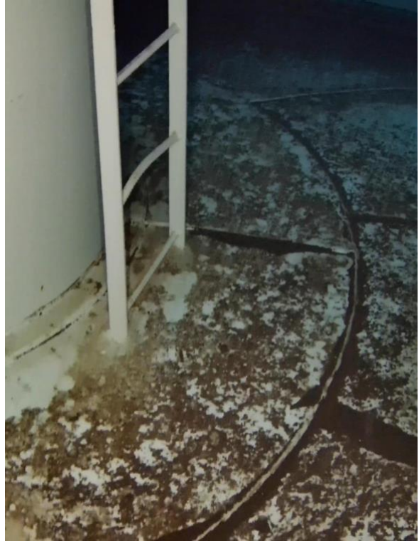
Caledonia WIDNR 5 Year ROV Inspection 750k Composite – 2022