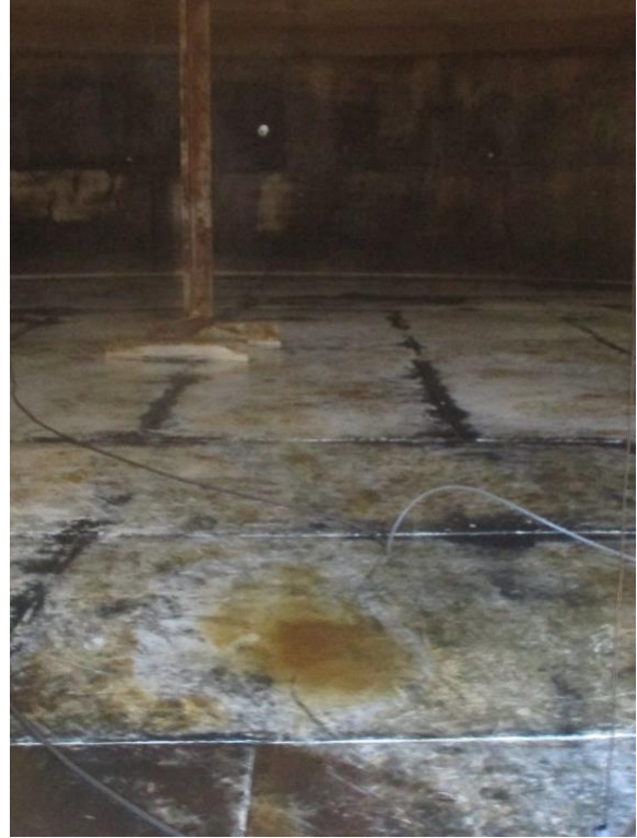
Cedarburg WIDNR 5 Year Drain and Clean Out Inspection 1MG Reservoir – 2022