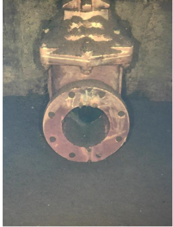
Middleton WIDNR 5 Year ROV Inspection 1MG Reservoir – 2022