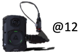
AXON BODY CAMERAS