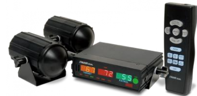
STALKER DUAL SL RADAR