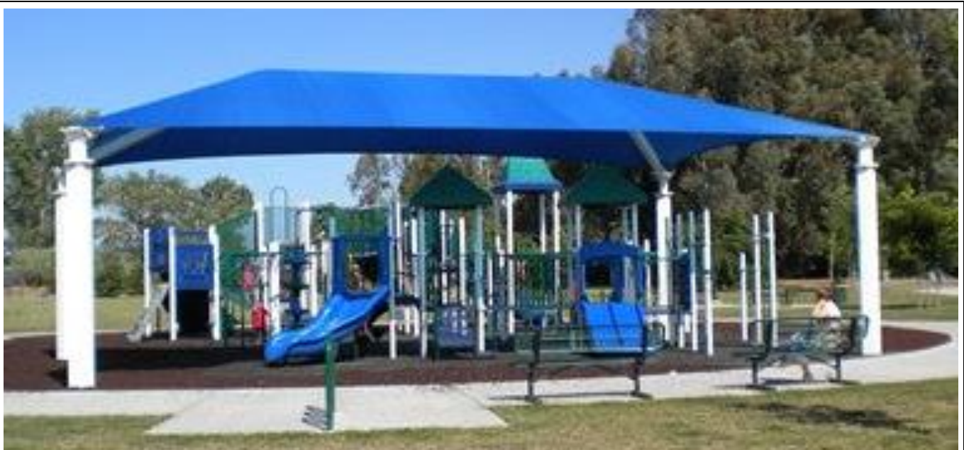
Figure 2 Design of Proposed Sunshade Shelter