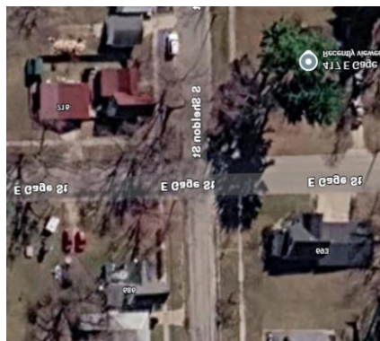
N. Sheldon Street and E. Kinder Street (stop control on N. Sheldon St., north and south approaches)