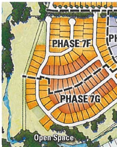
Crop of Windsong Ranch Phase 7F/7G