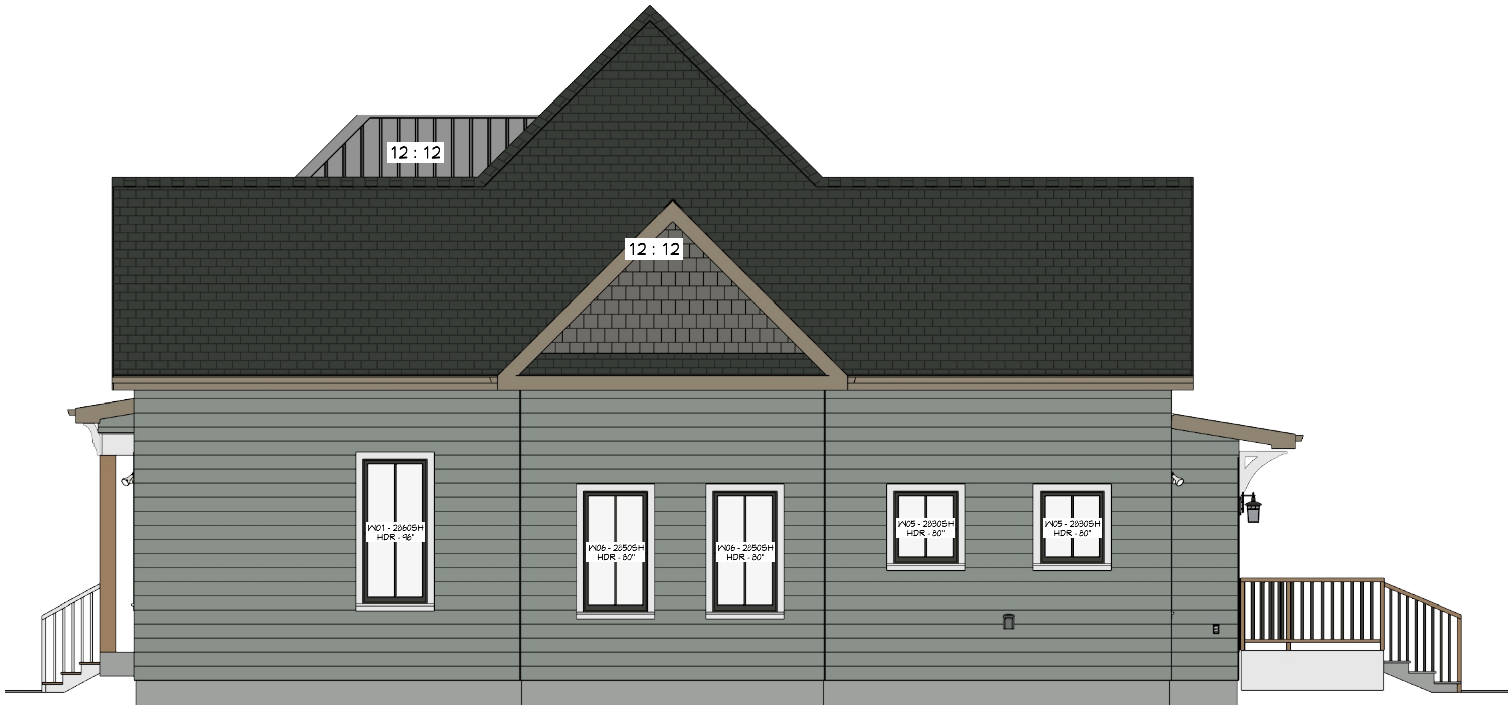
Exterior Elevation Back