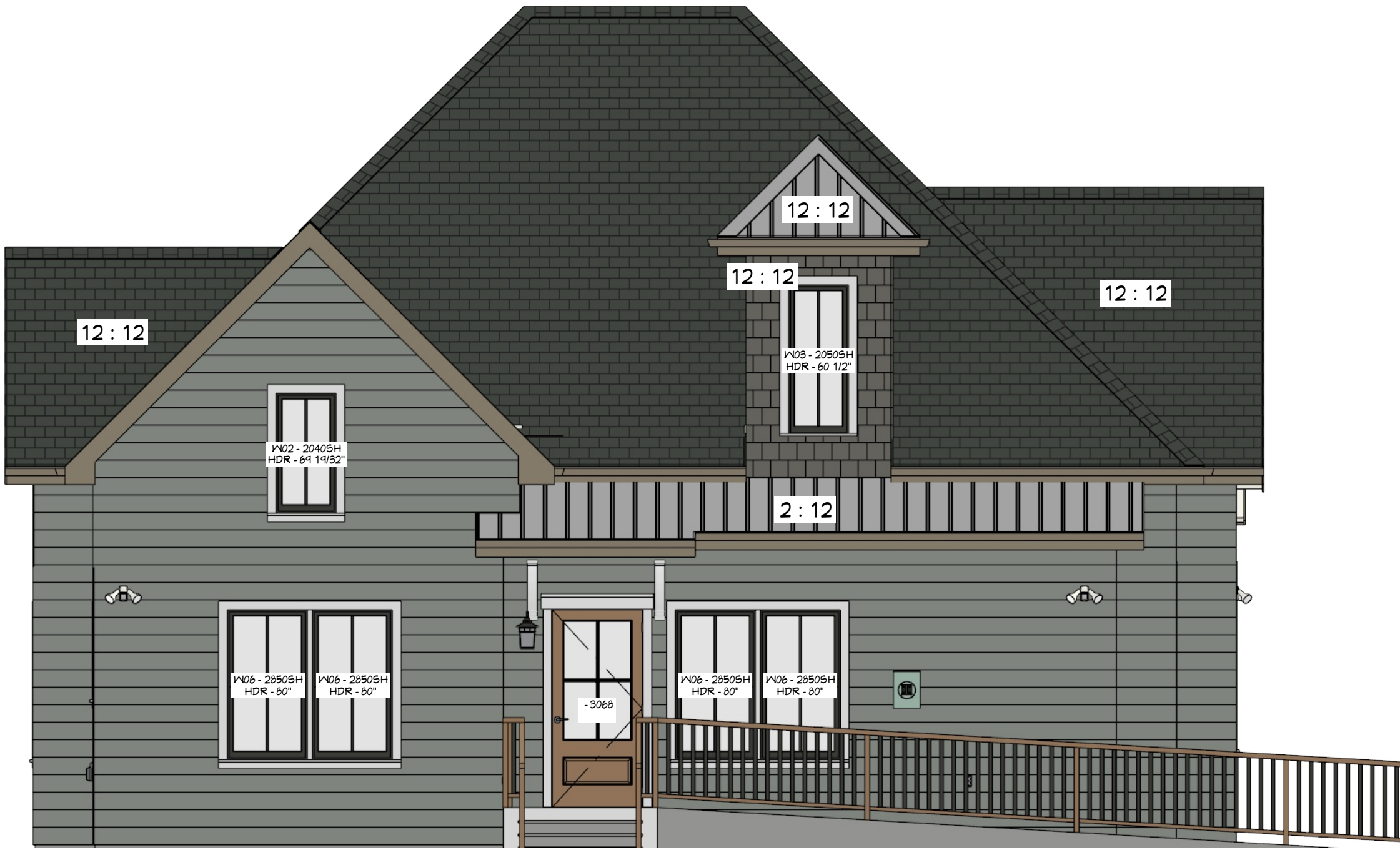
Exterior Elevation Left