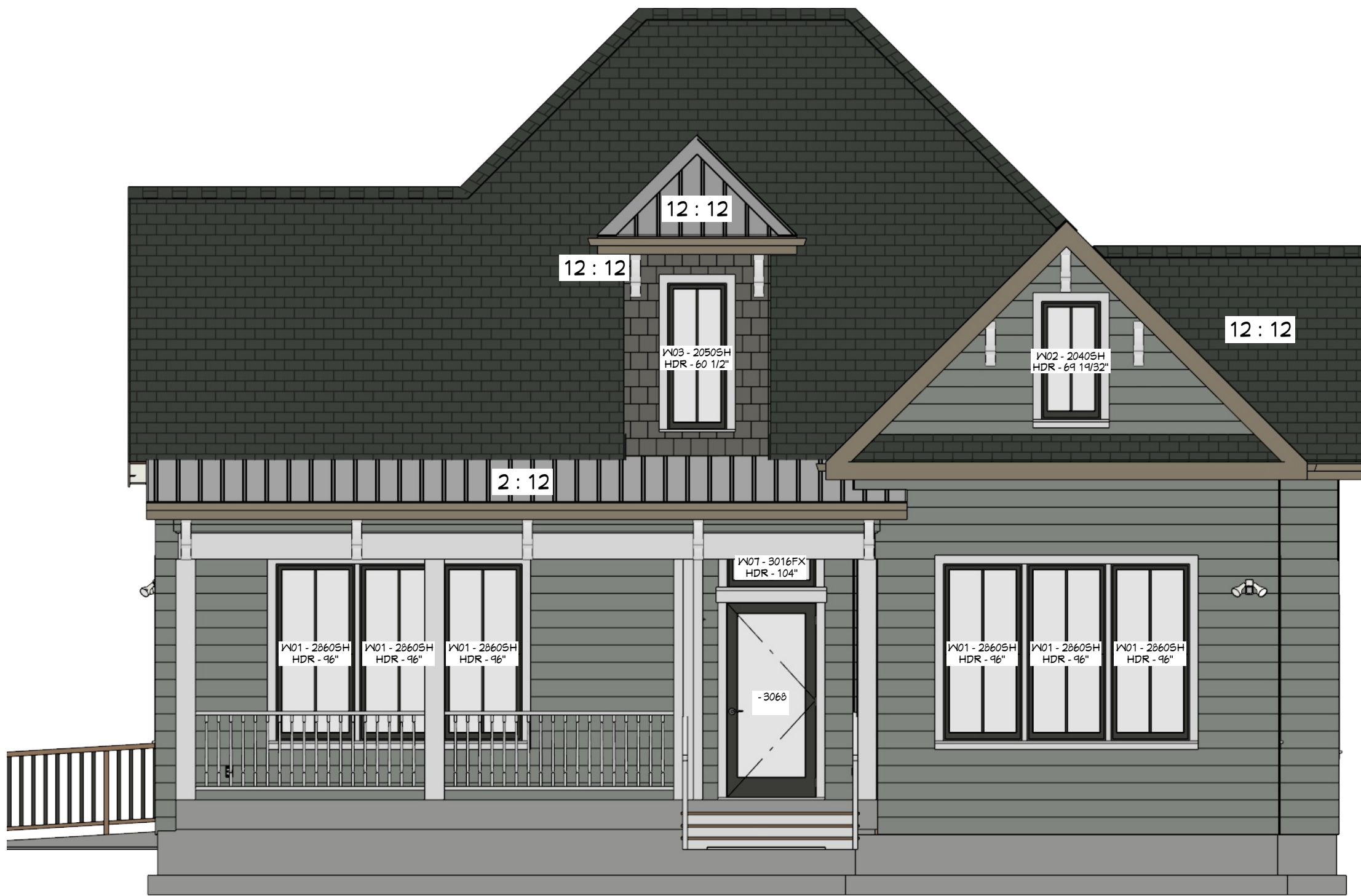
Exterior Elevation Right