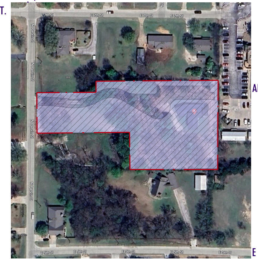
02 VICINITY MAP SCALE: NTS